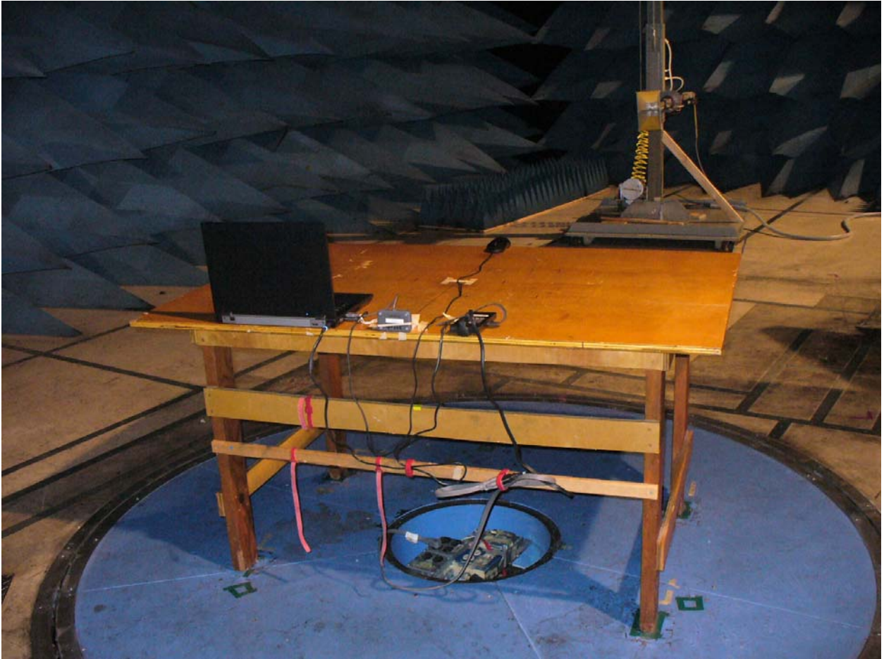
Figure 2: Radiated Emissions – Back View