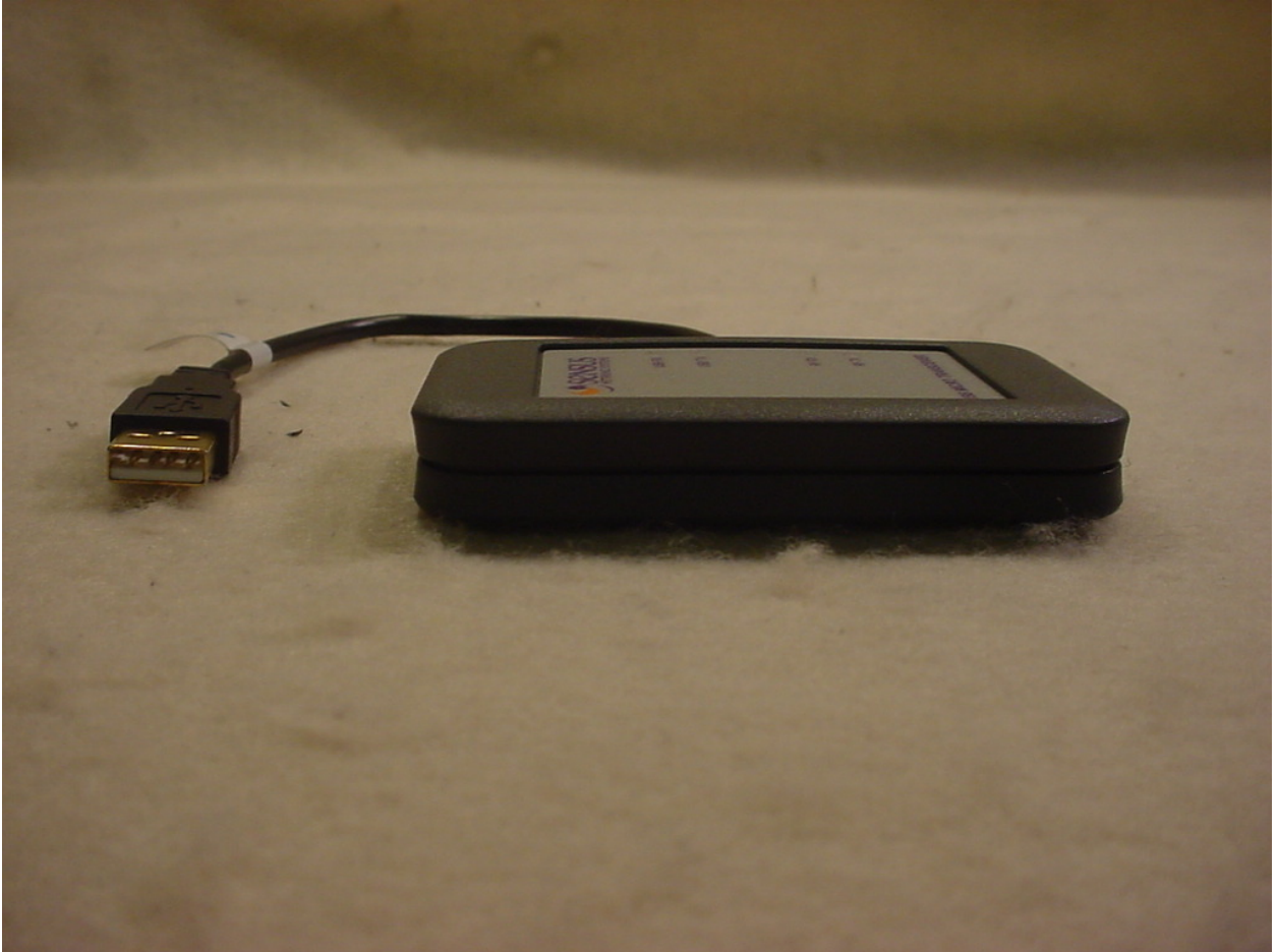
Figure 5: Side View