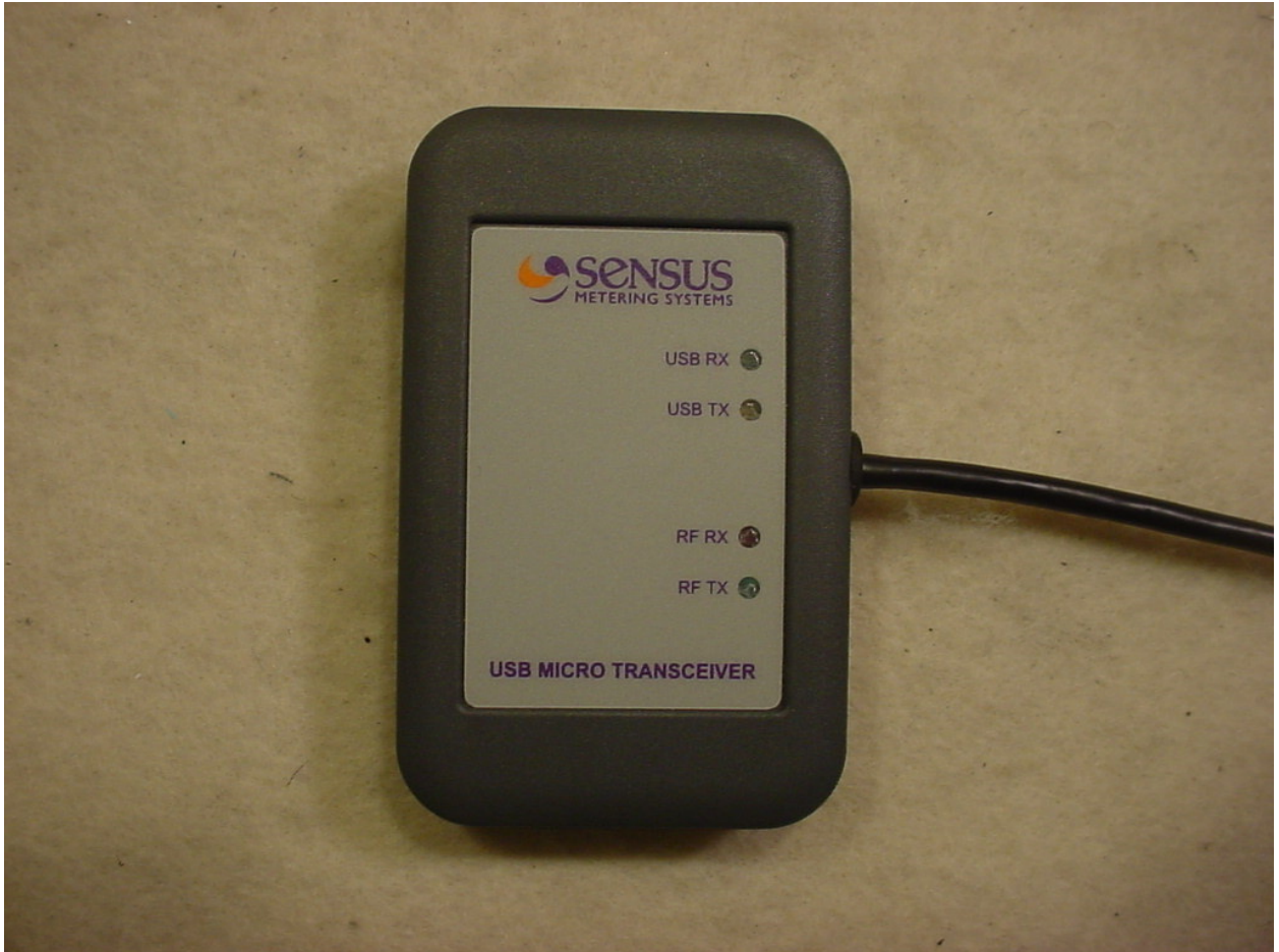
Figure 2: Front View