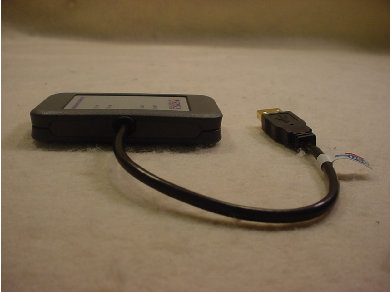
Figure 4: Side View