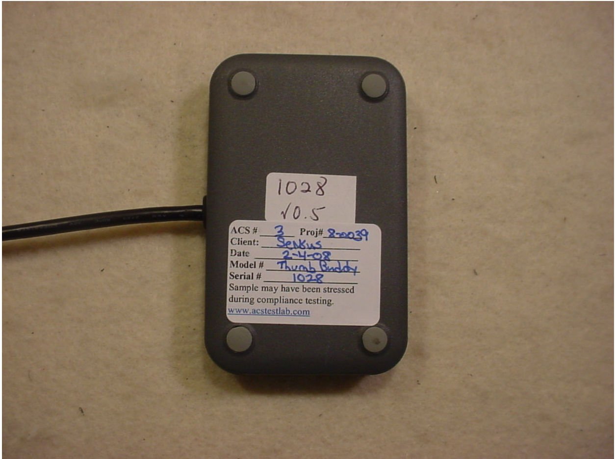
Figure 3: Back View