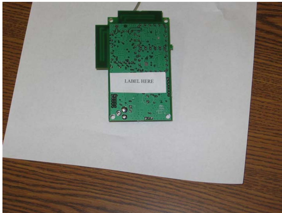
Figure 2: Label Location