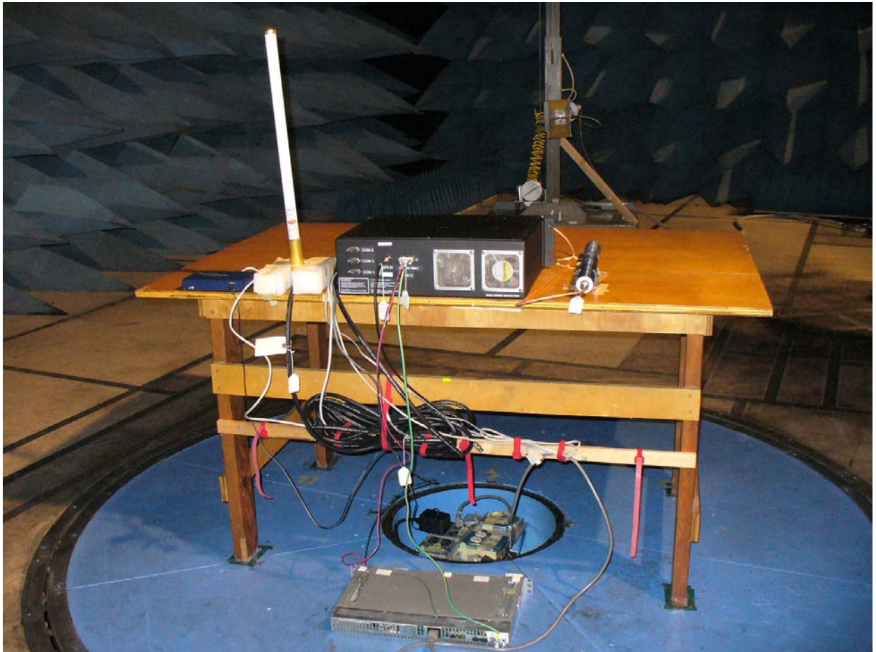
Figure 2: Radiated Emissions – Back View