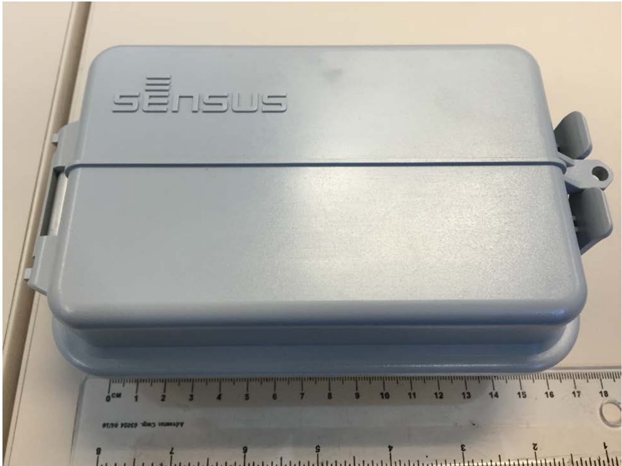
Figure 1: Top