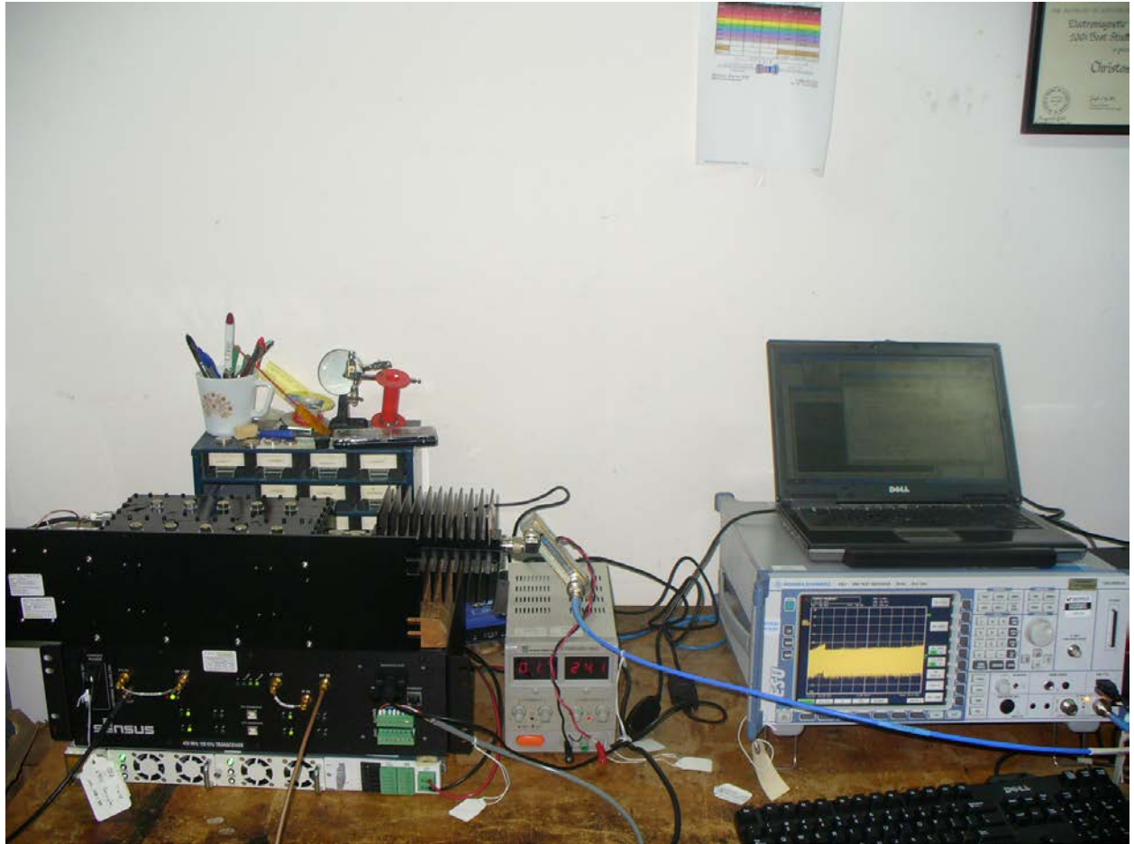
Figure 3: RF Conducted Emissions