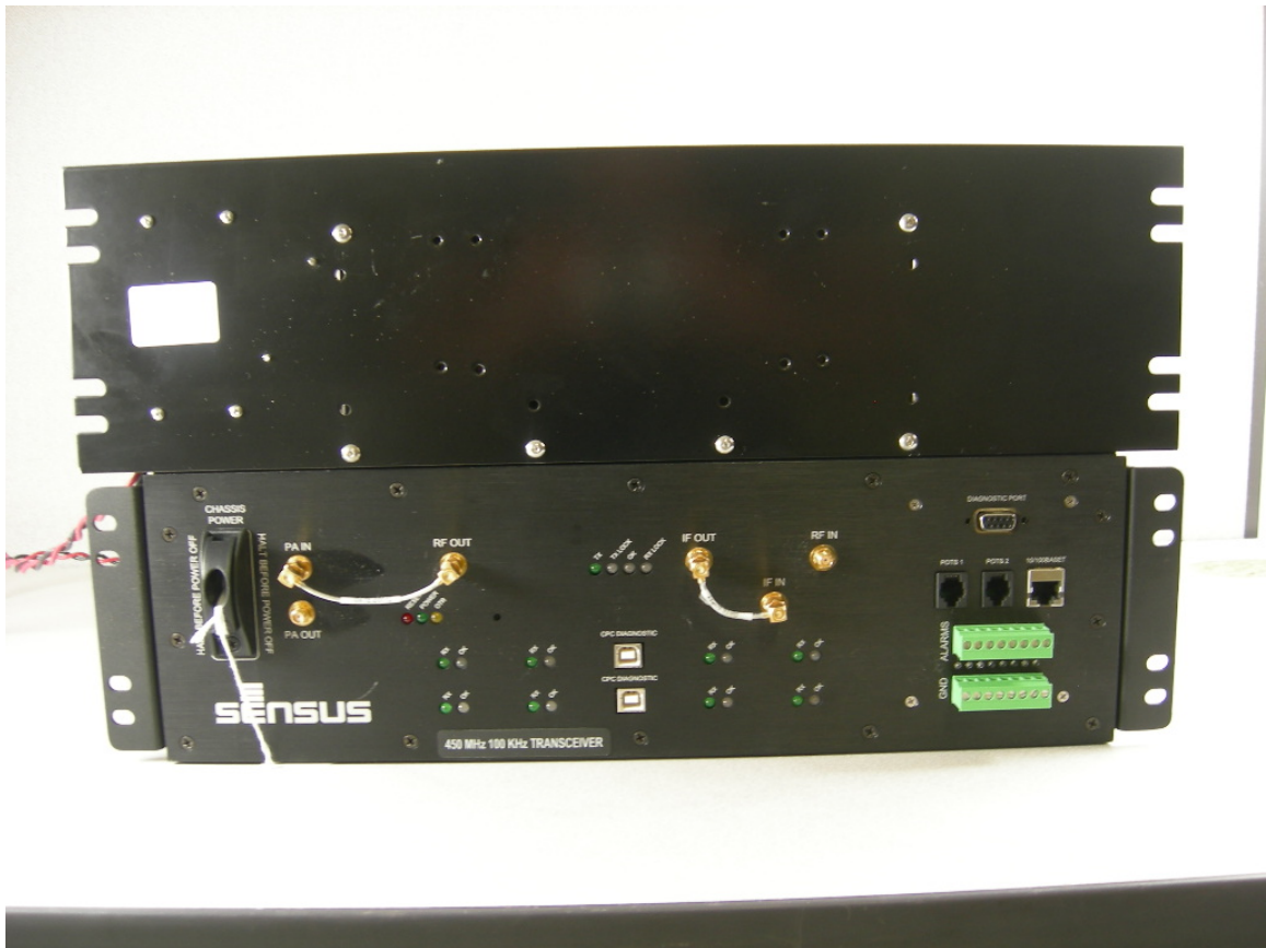
Figure 8: Front View with Duplexer