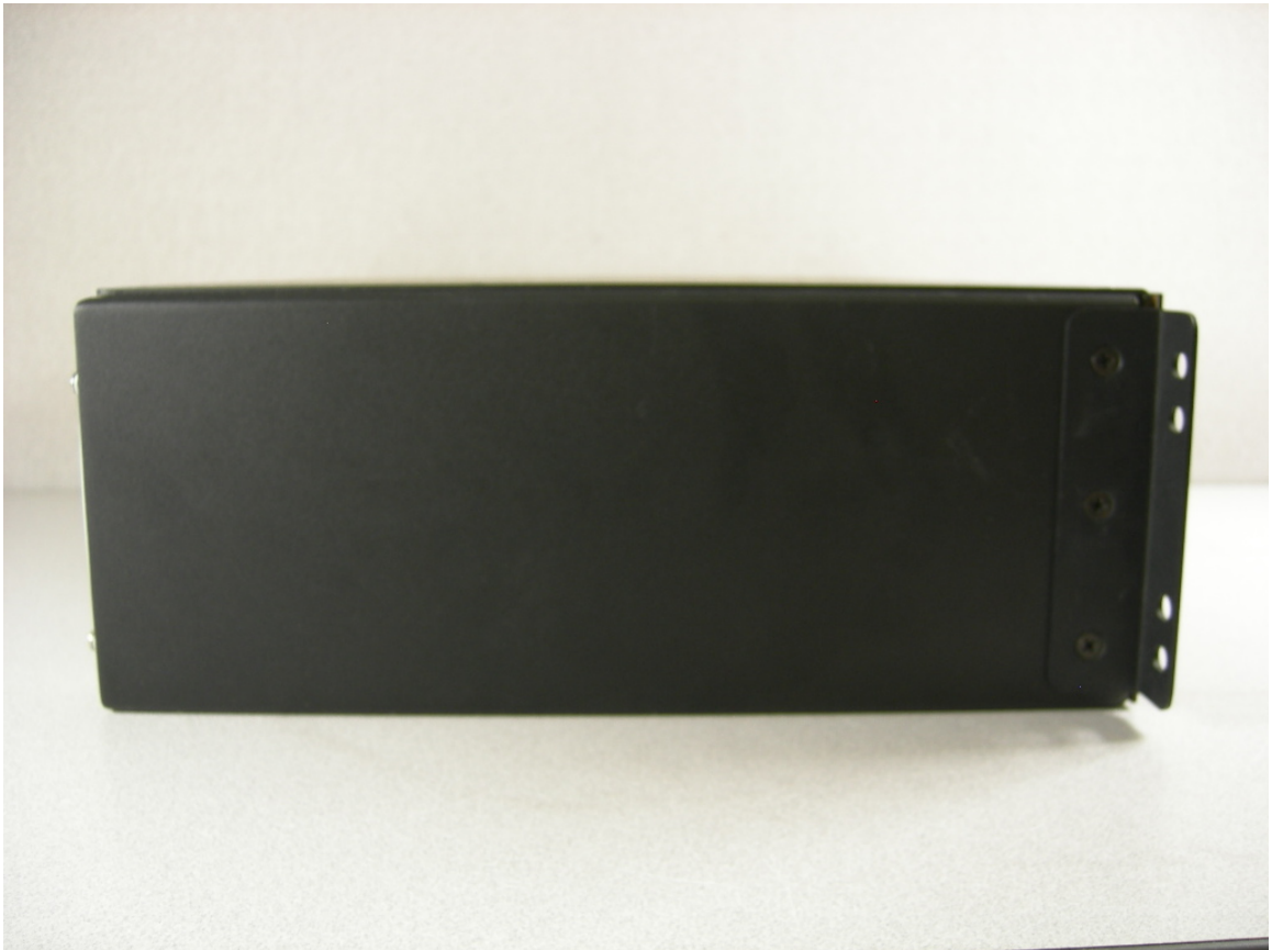
Figure 5: Left Side View