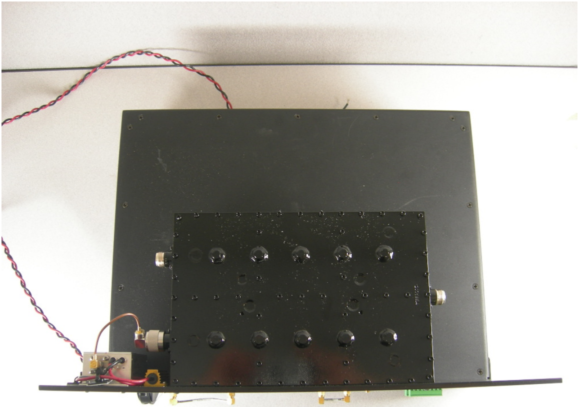
Figure 7: Top View with Duplexer