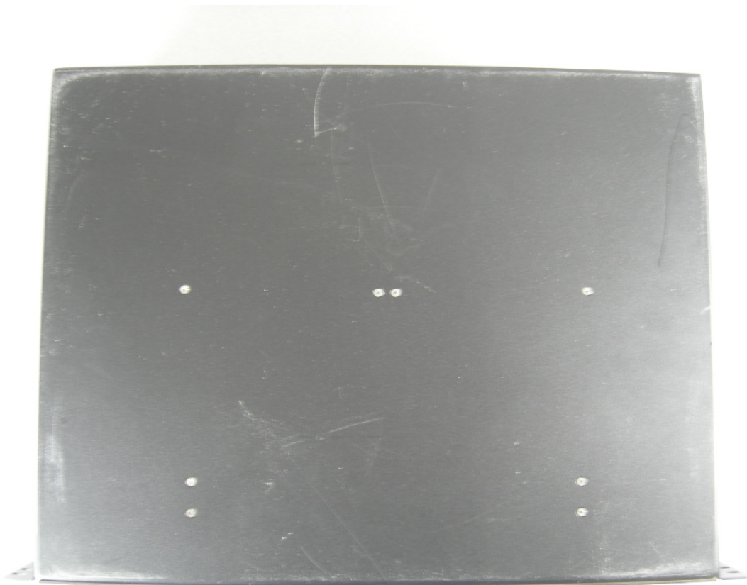
Figure 2: Bottom View