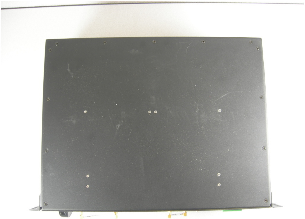
Figure 1: Top View