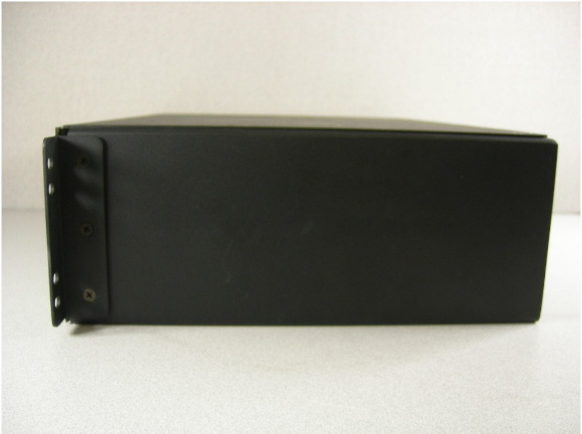
Figure 6: Right Side View