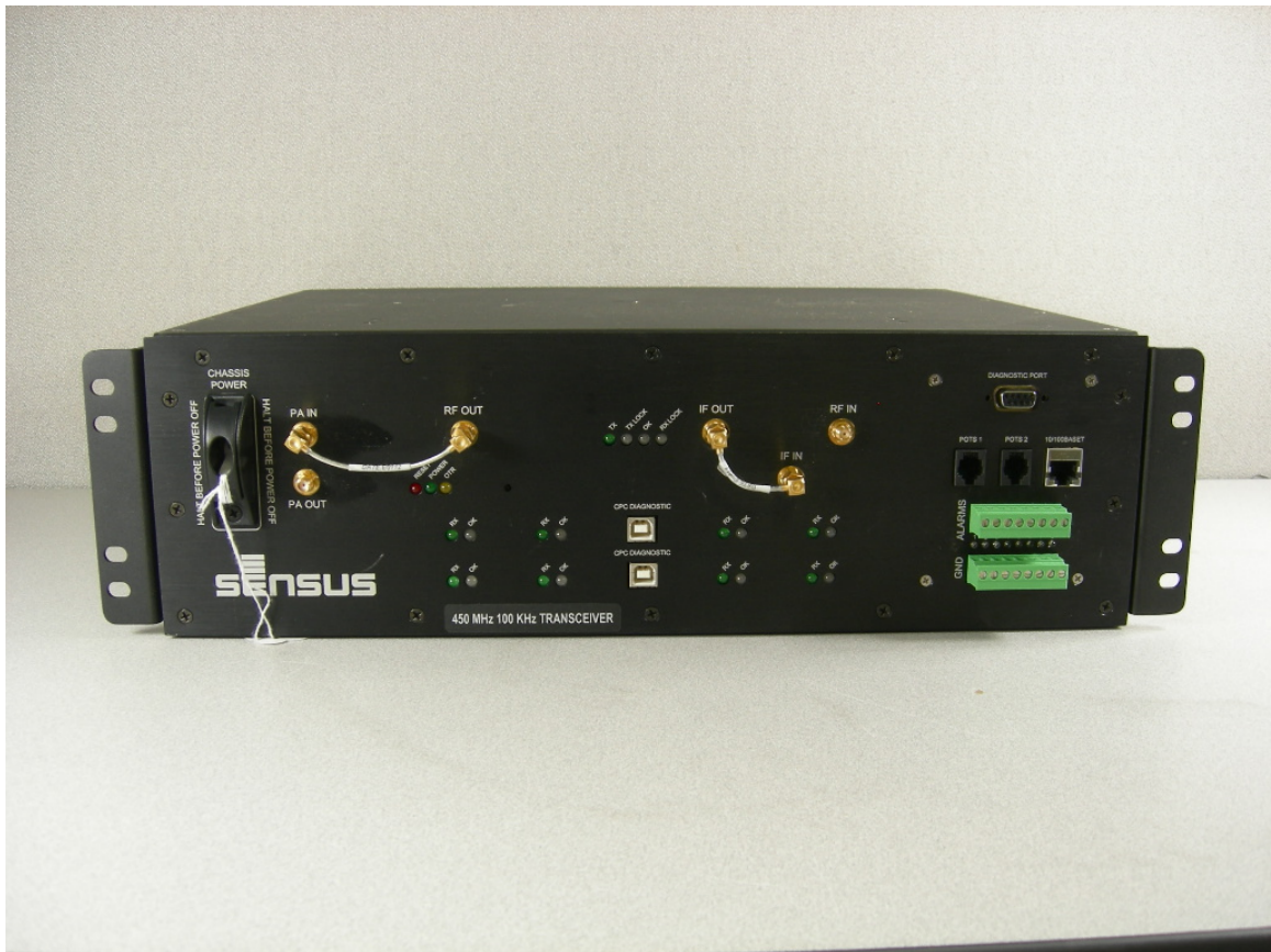
Figure 3: Front View