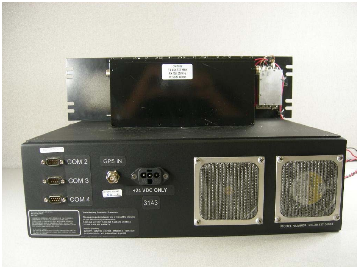
Figure 9: Rear View with Duplexer