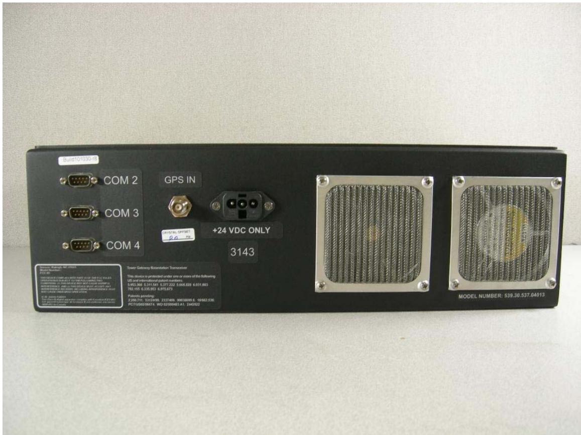
Figure 4: Rear View