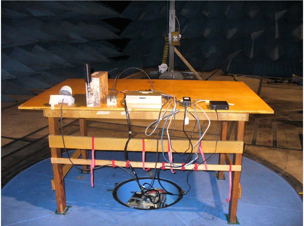
Figure 2: Radiated Emissions – Back View