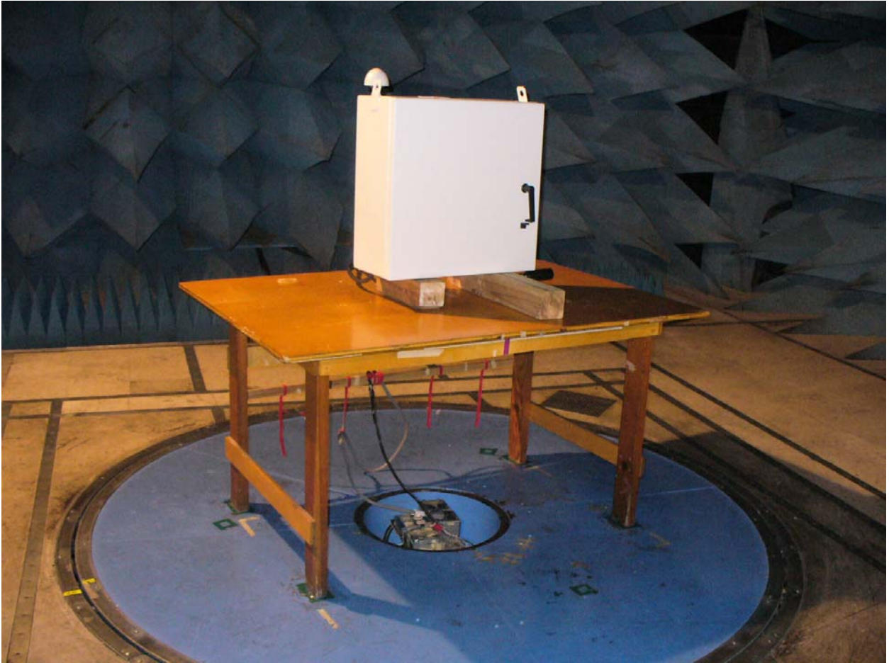
Figure 1: Radiated Emissions – Front View