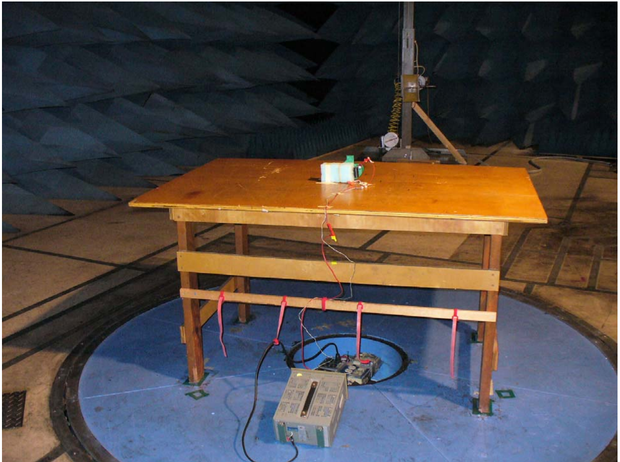
Figure 2: Radiated Emissions – Back View