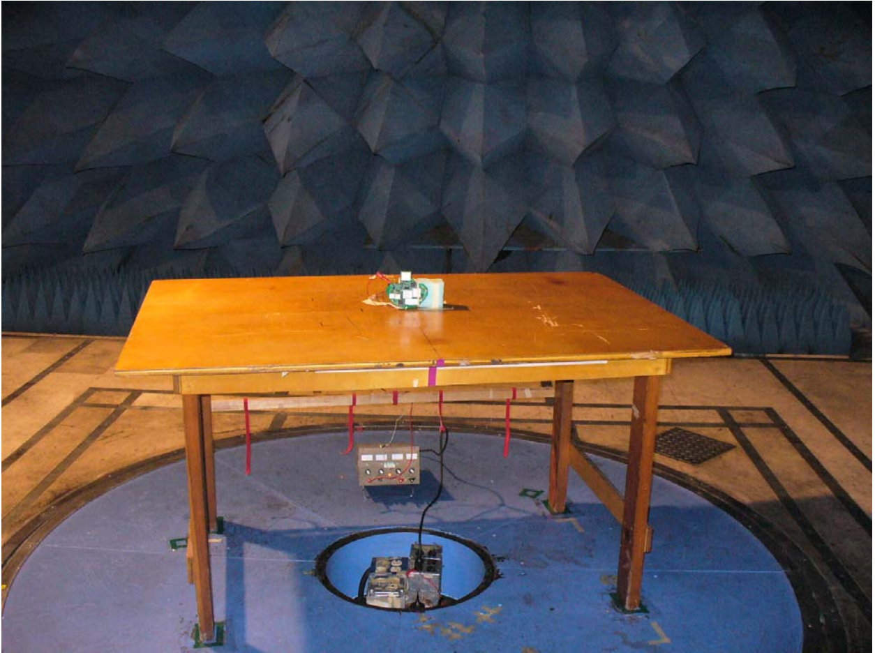
Figure 1: Radiated Emissions – Front View