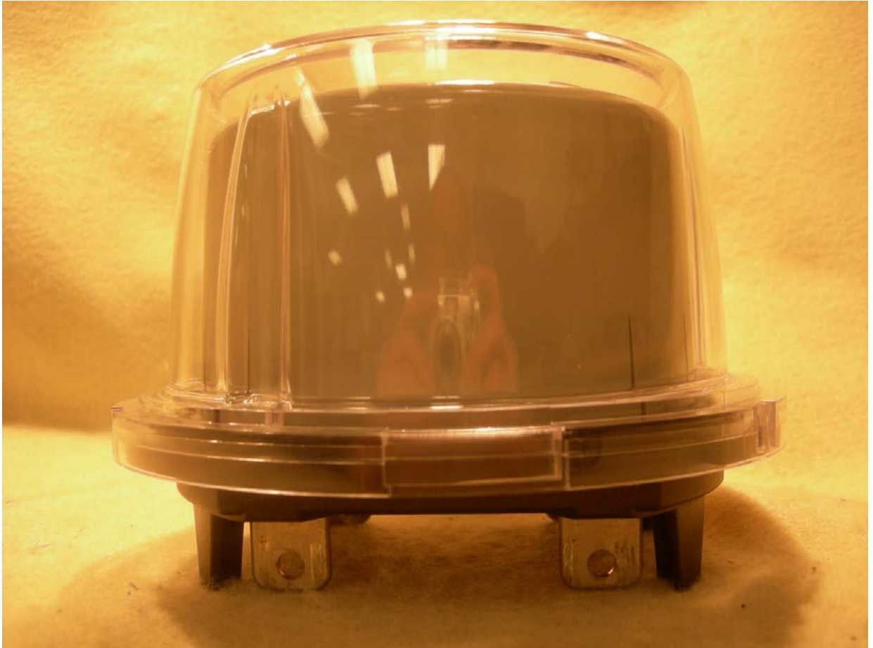
Figure 4: Side View