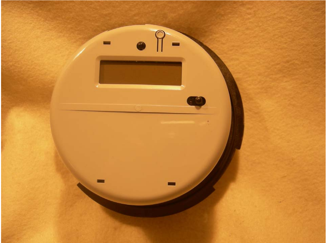
Figure 1: Top View