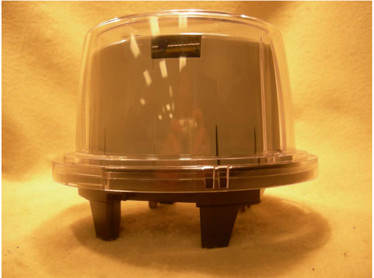
Figure 3: Side View