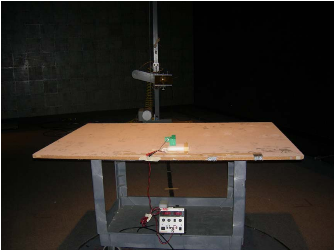
Figure 1: Radiated Emissions