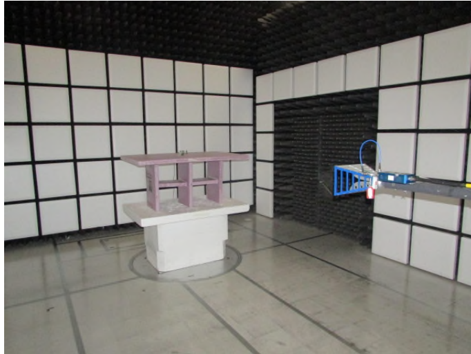
Figure 3: Radiated Emissions – Front – Above 1GHz- YPOS