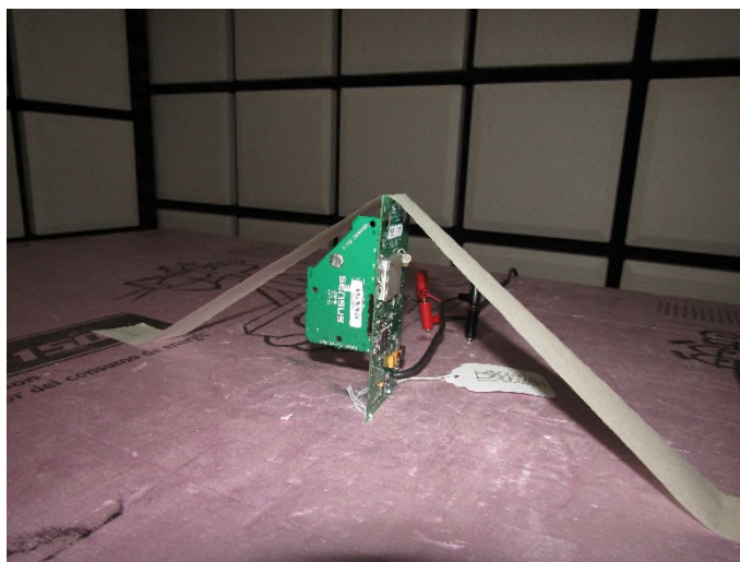
Figure 7: Radiated Emissions – Back – Above 1GHz – ZPOS