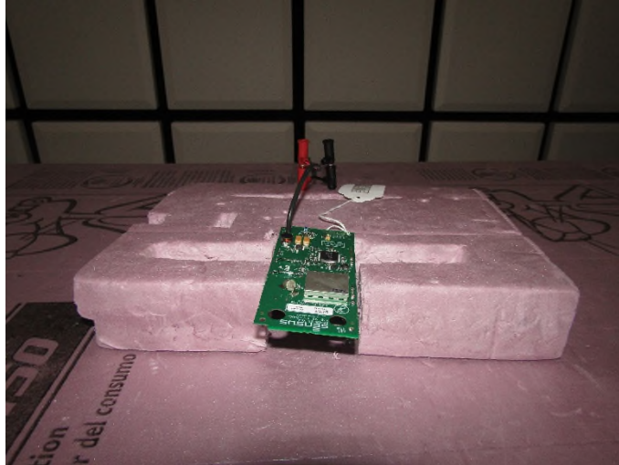
Figure 5: Radiated Emissions – Front – Above 1GHz – XPOS