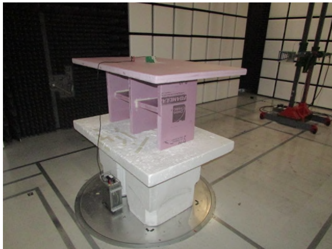
Figure 4: Radiated Emissions – Back – Above 1GHz – YPOS