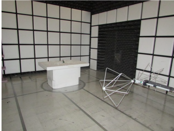
Figure 1: Radiated Emissions – Front – Below 1GHz – YPOS