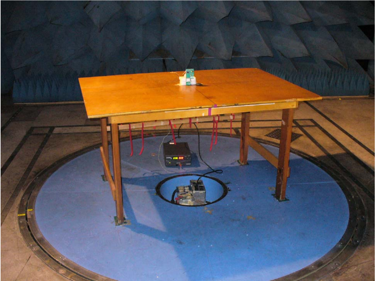
Figure 1: Radiated Emissions – Front View