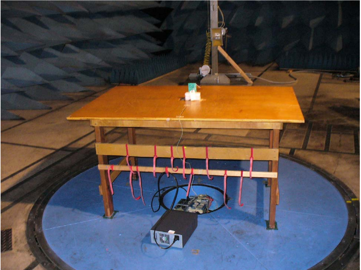
Figure 2: Radiated Emissions – Back View