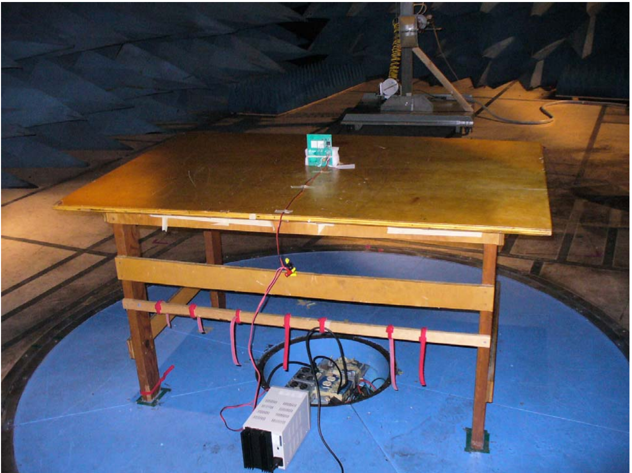
Figure 2: Radiated Emissions – Back View