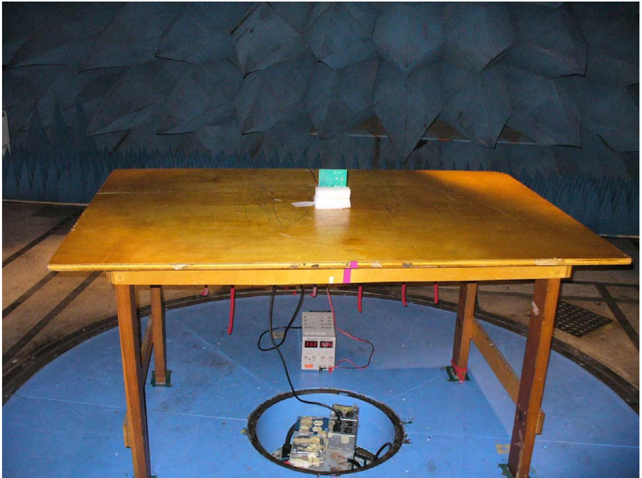
Figure 1: Radiated Emissions – Front View