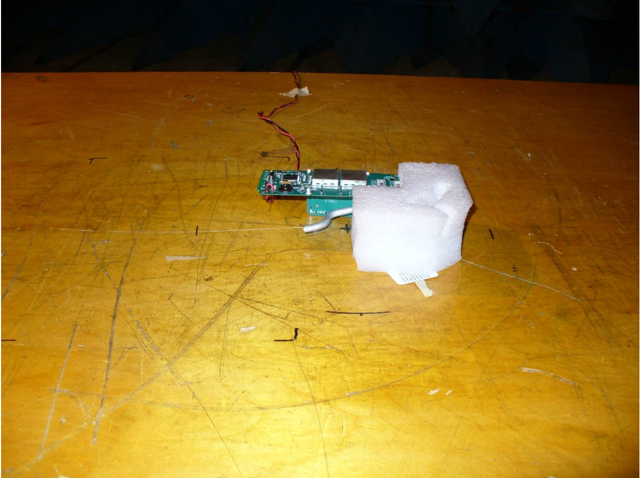
Figure 3: Radiated Emissions – Front View Close Up