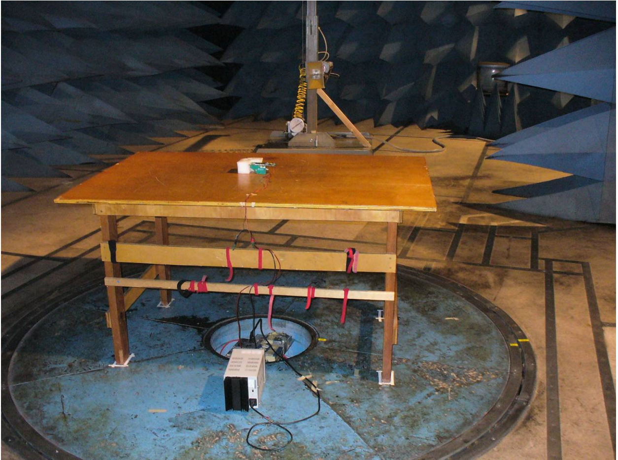
Figure 2: Radiated Emissions – Back View