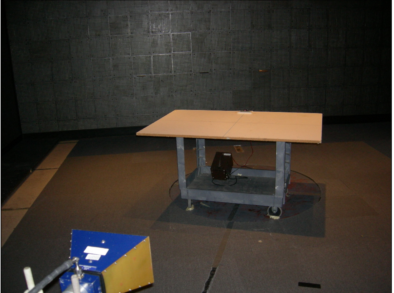
Figure 2: Radiated Emissions