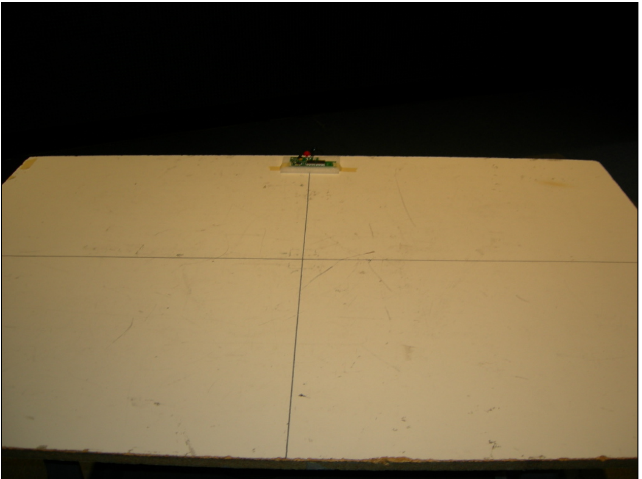
Figure 1: Radiated Emissions