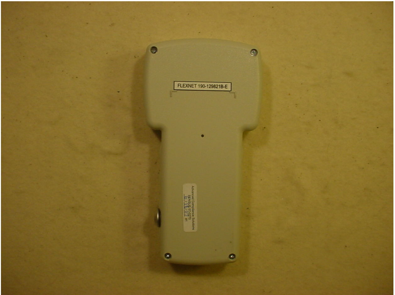
Figure 2: External Photographs – Back