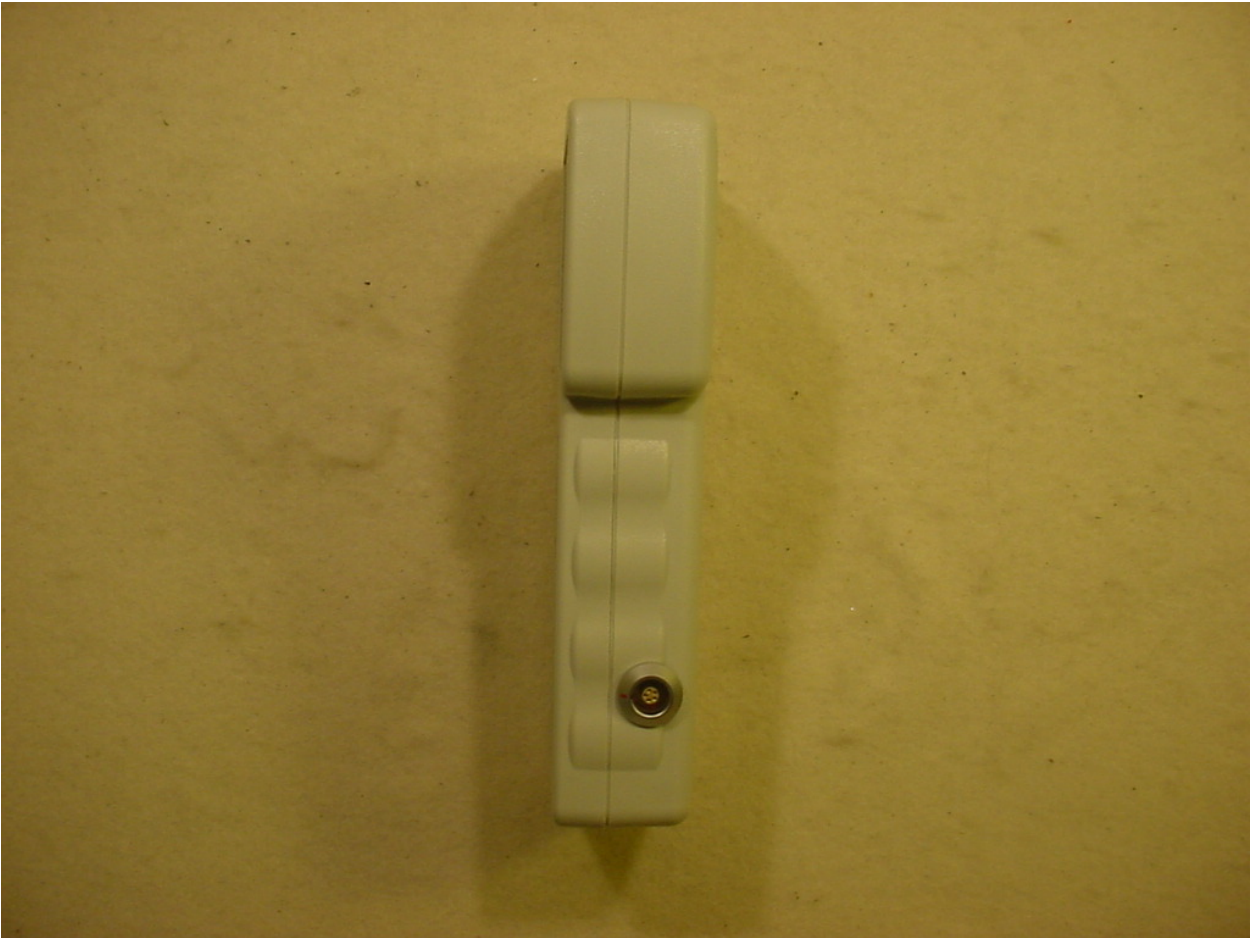
Figure 3: External Photographs – Side