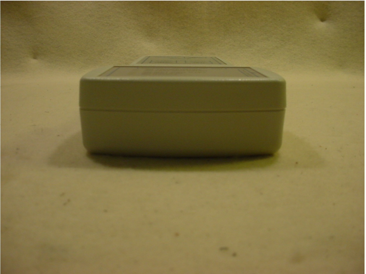
Figure 5: External Photographs – Top