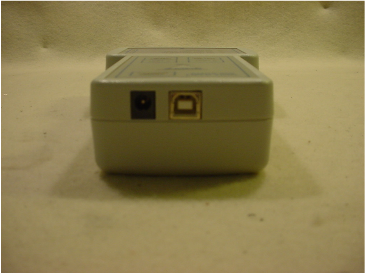
Figure 6: External Photographs – Bottom