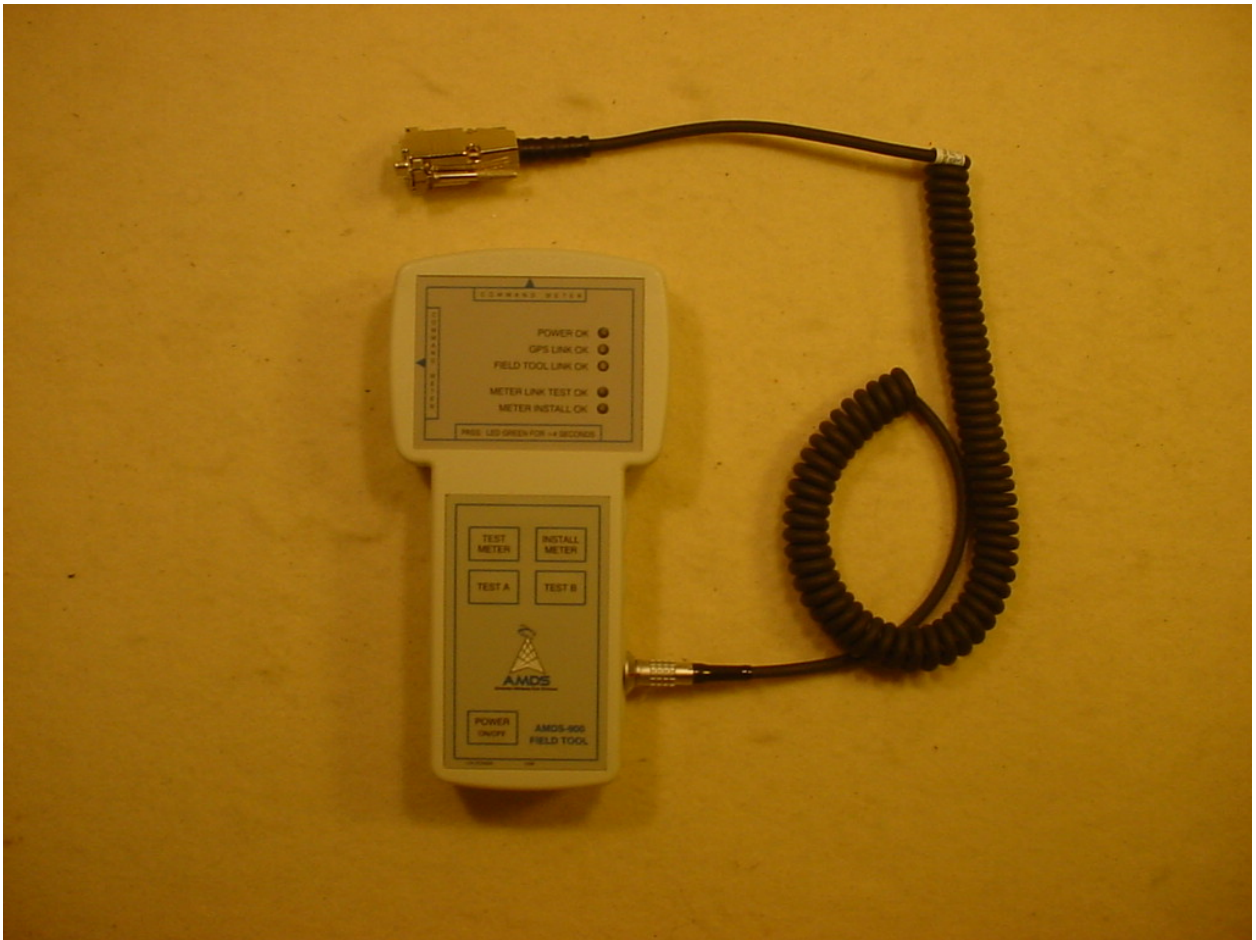
Figure 1: External Photographs – Front