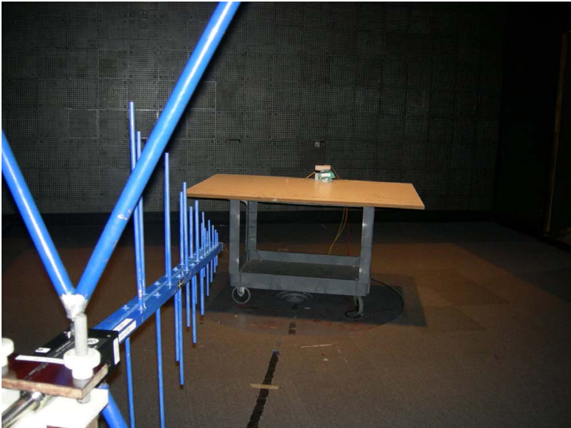
Figure 4: Radiated Emissions - Unintentional