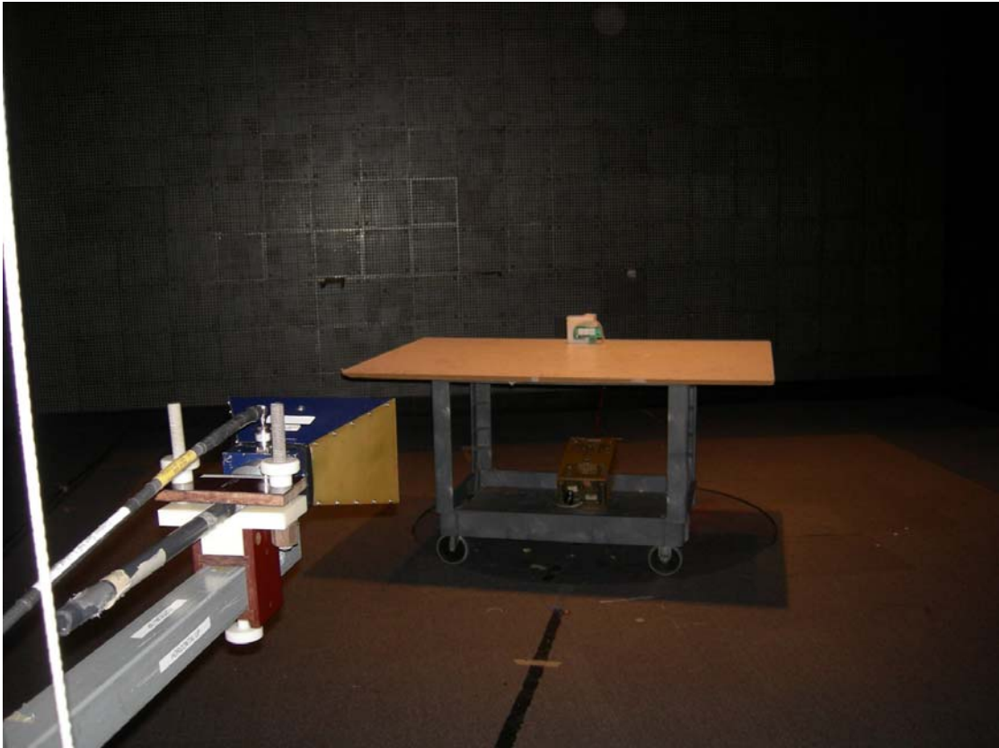
Figure 2: Radiated Emissions – Intentional