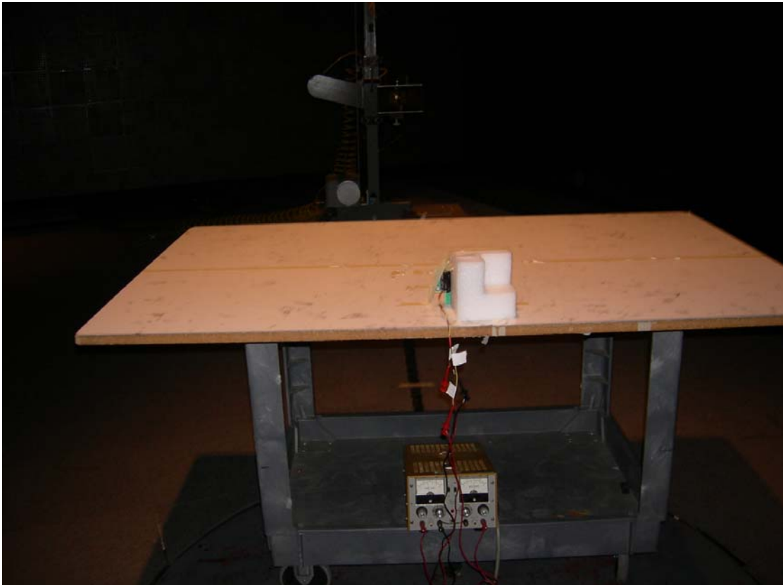
Figure 1: Radiated Emissions – Intentional