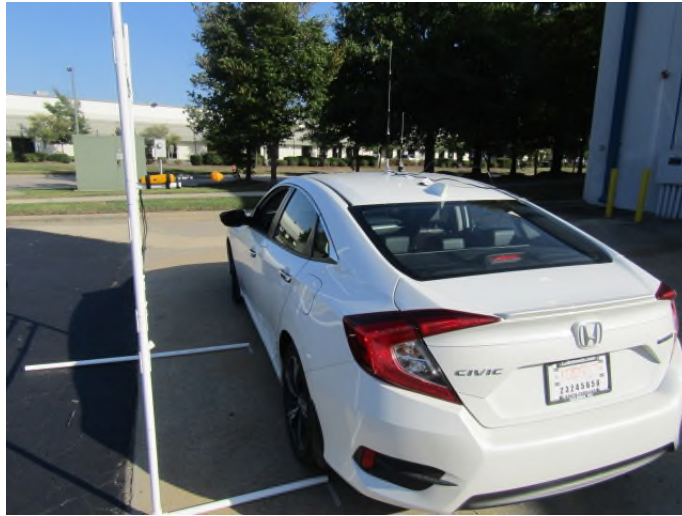
Figure 1 – Bystander at 0 degree - Test Set-up