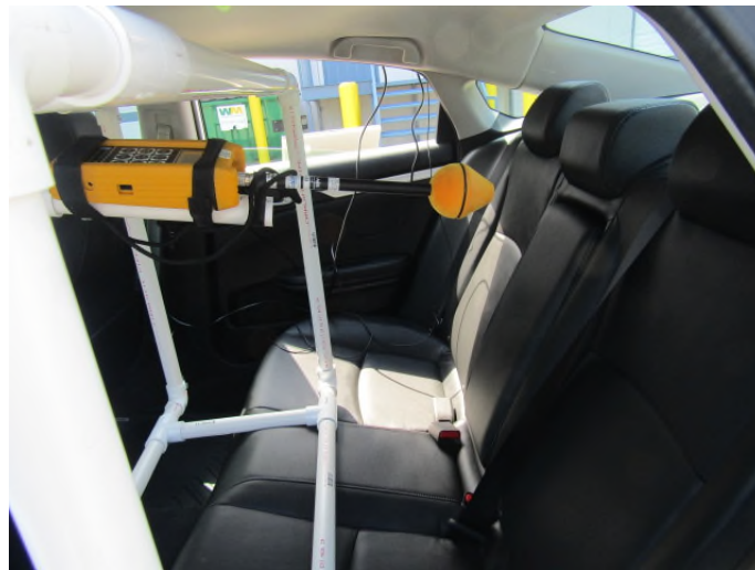
Figure 5 – Passenger in back seat - Test Set-up