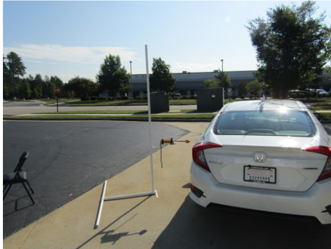
Figure 3 – Bystander at 60 degrees - Test Set-up