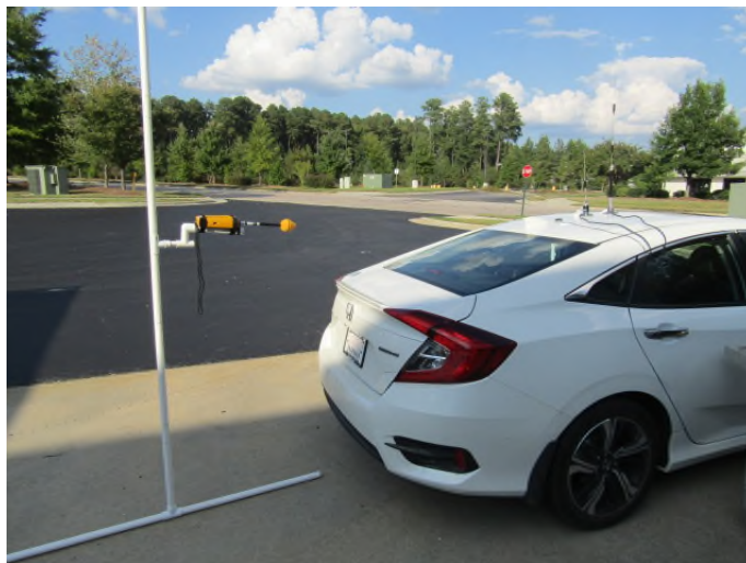
Figure 4 – Bystander at 90 degrees - Test Set-up