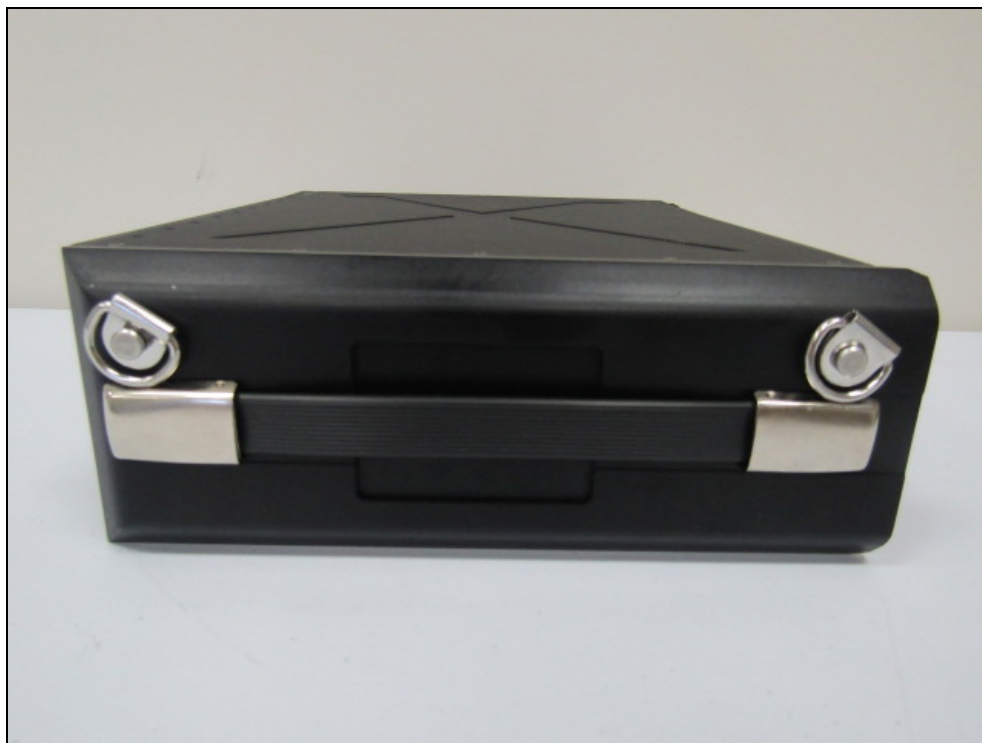
Figure 4: Side