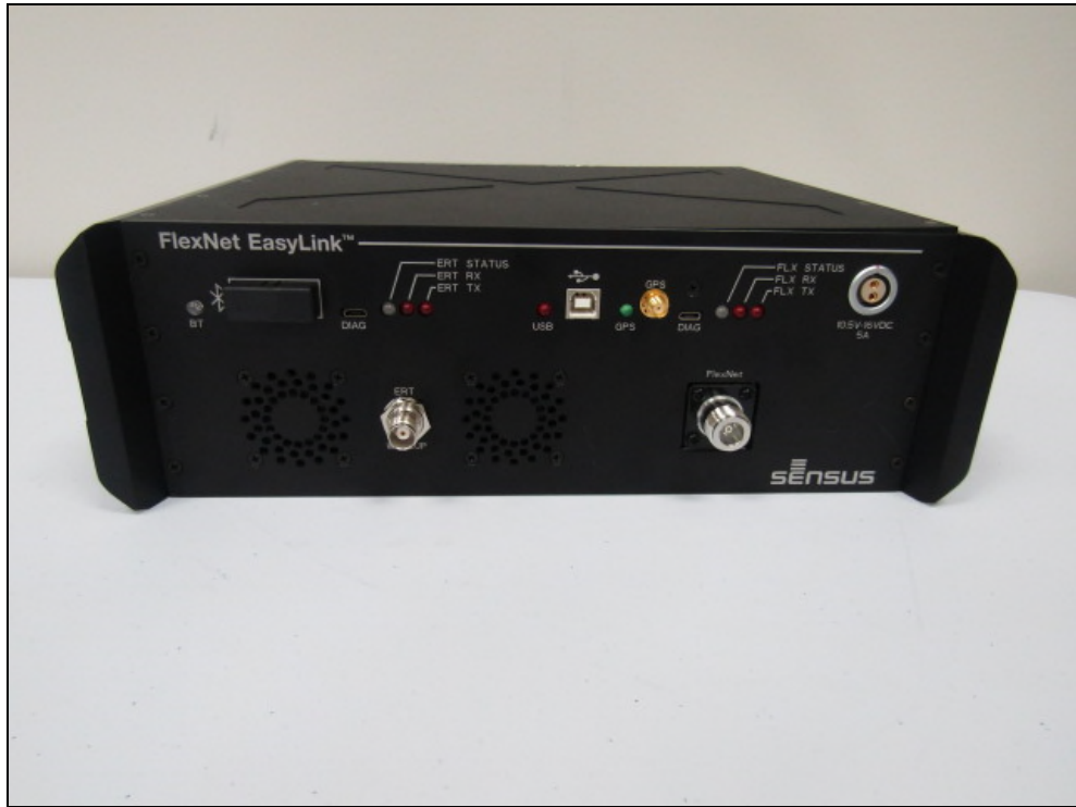
Figure 1: Front