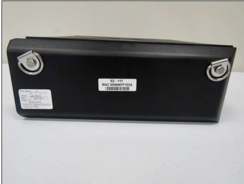
Figure 3: Side