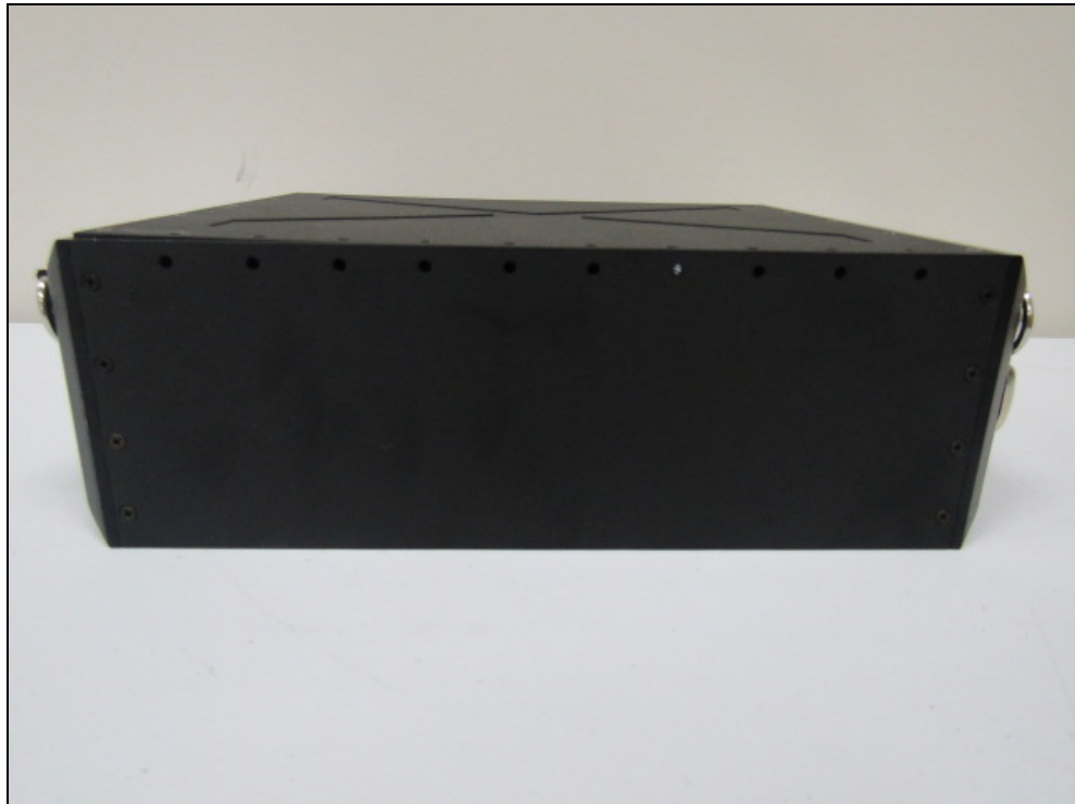
Figure 2: Back