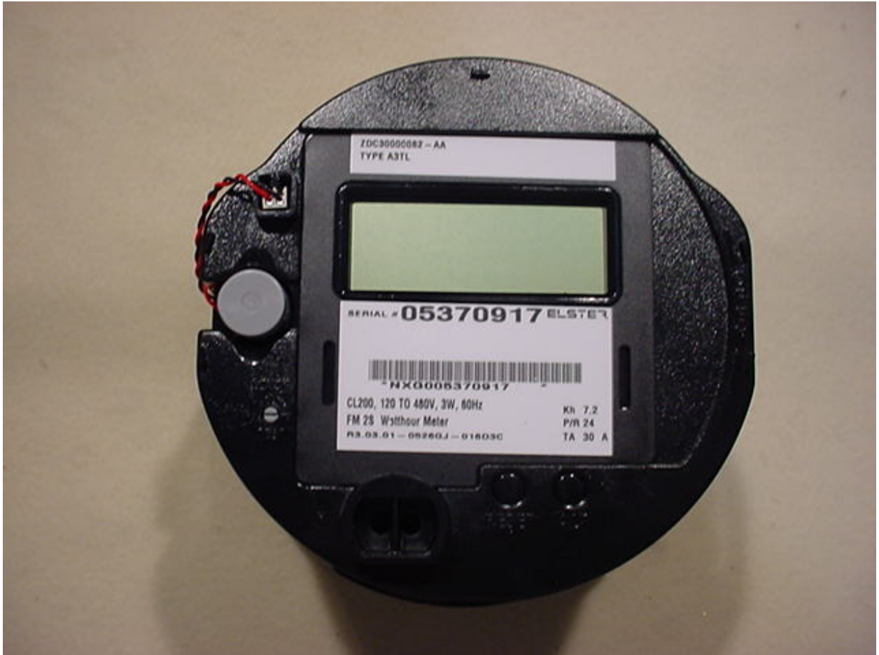
Figure 3: External Photographs – Top View Housing Removed