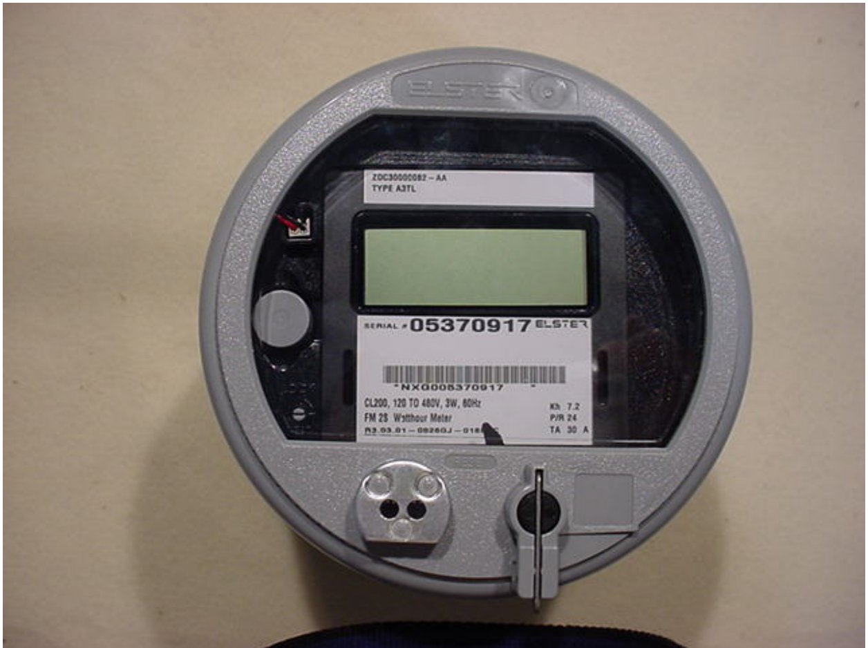
Figure 1: External Photographs – Top View