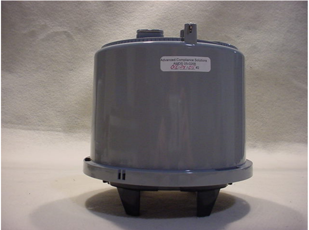
Figure 2: External Photographs – Side View