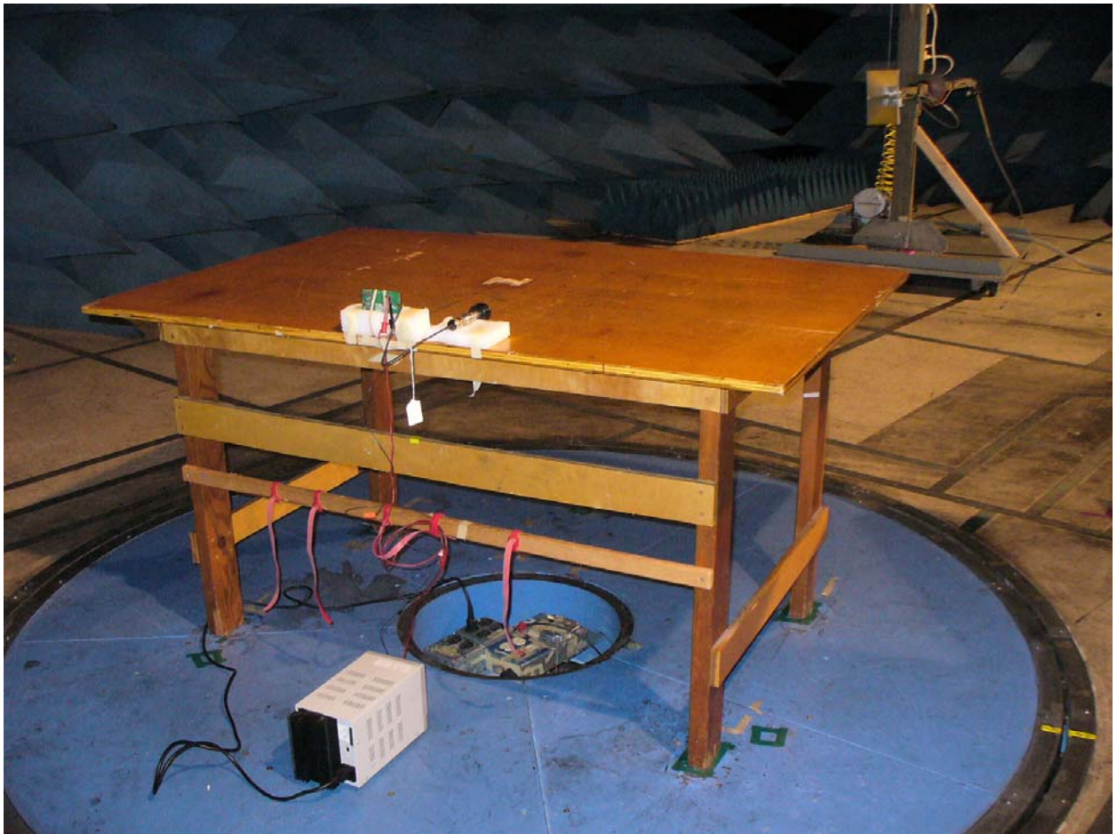
Figure 2: Radiated Emissions – Back View