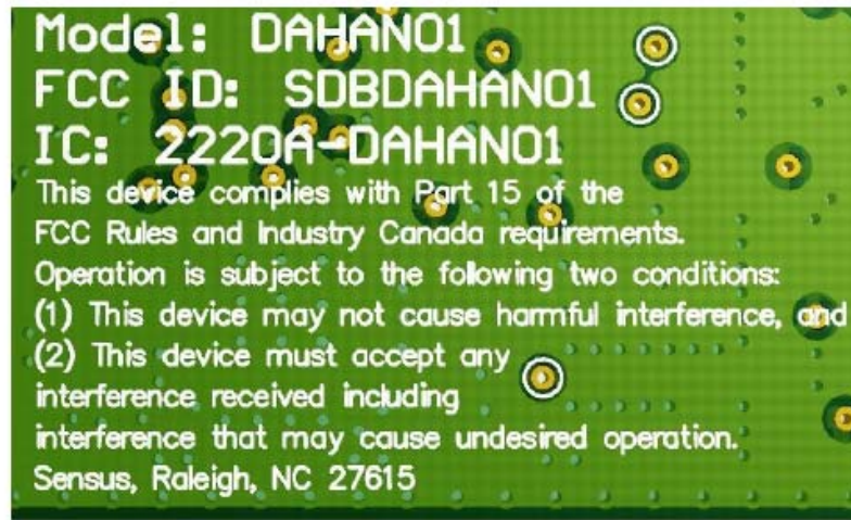
Figure 1: Compliance information silkscreened on DAHAN01 Radio Module PCB