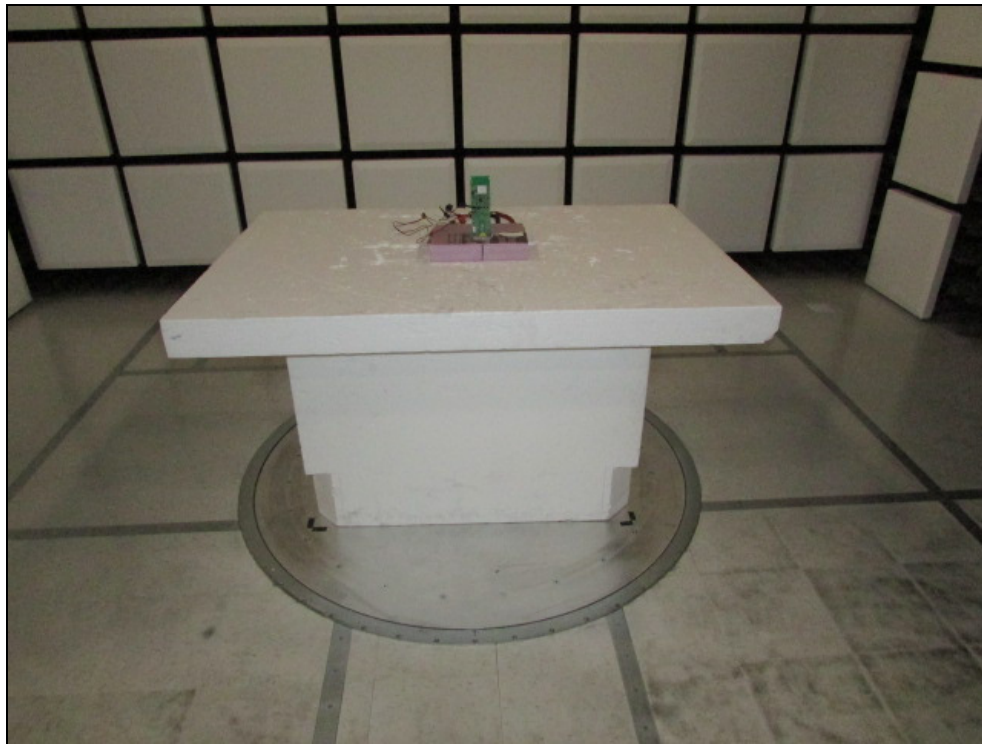
Figure 1: Front View – Below 1 GHz