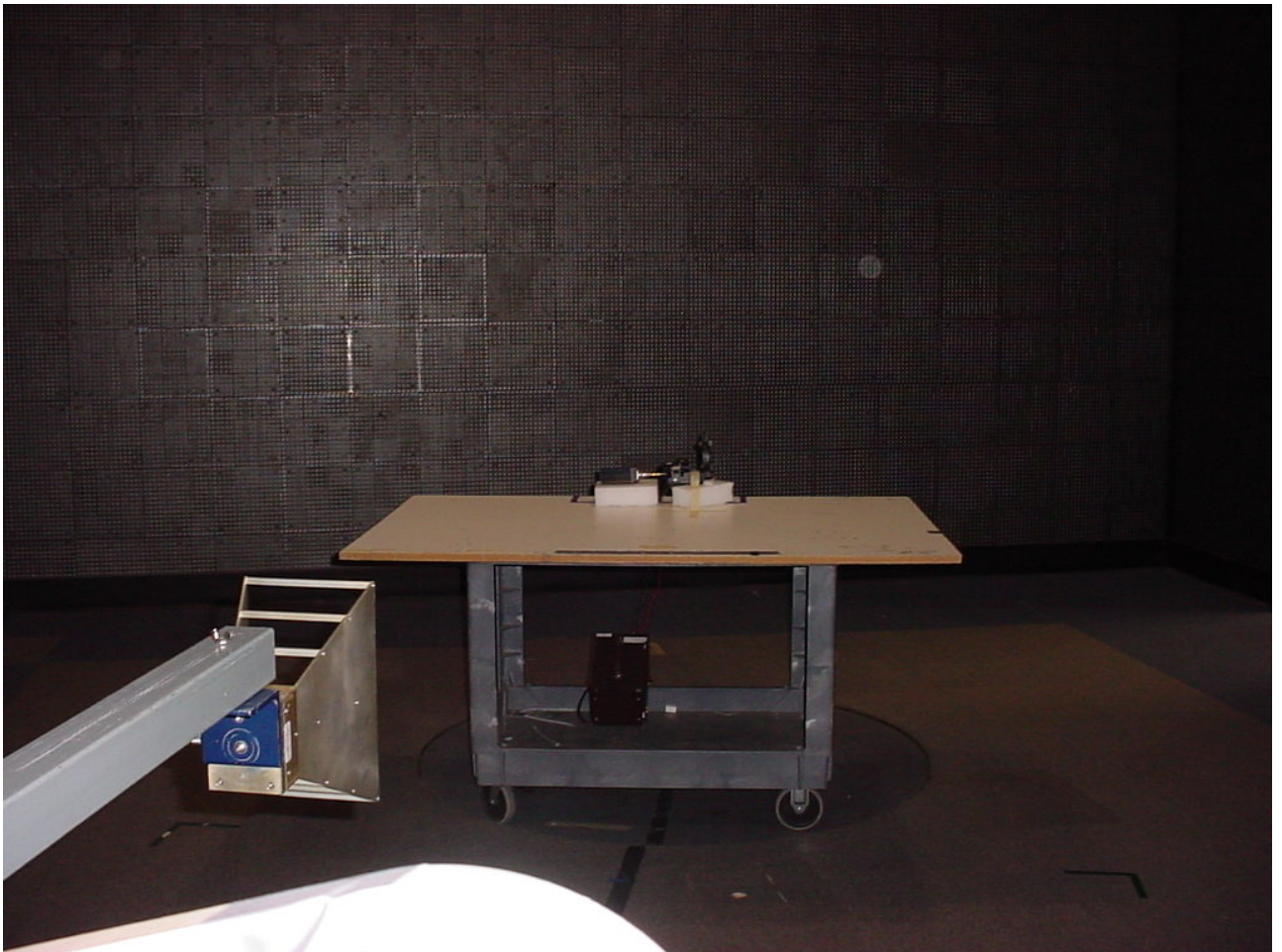
Figure 2: Intentional Radiated Emissions