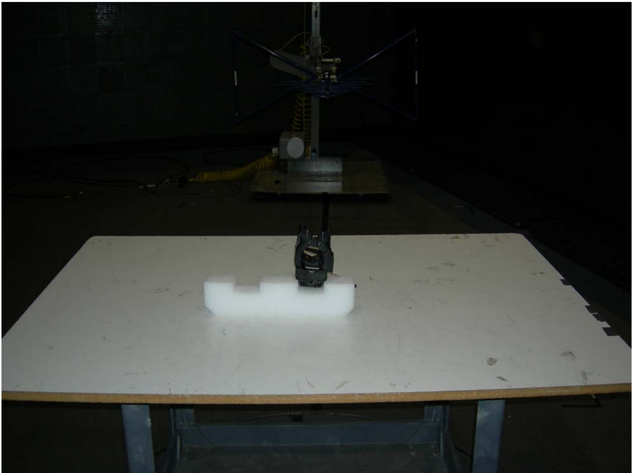
Figure 4: Unintentional Radiated Emissions.