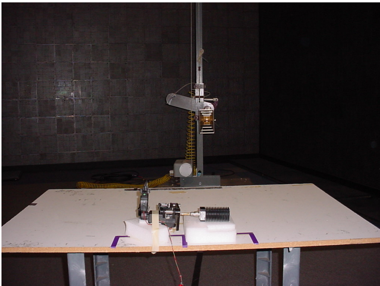
Figure 1: Intentional Radiated Emissions