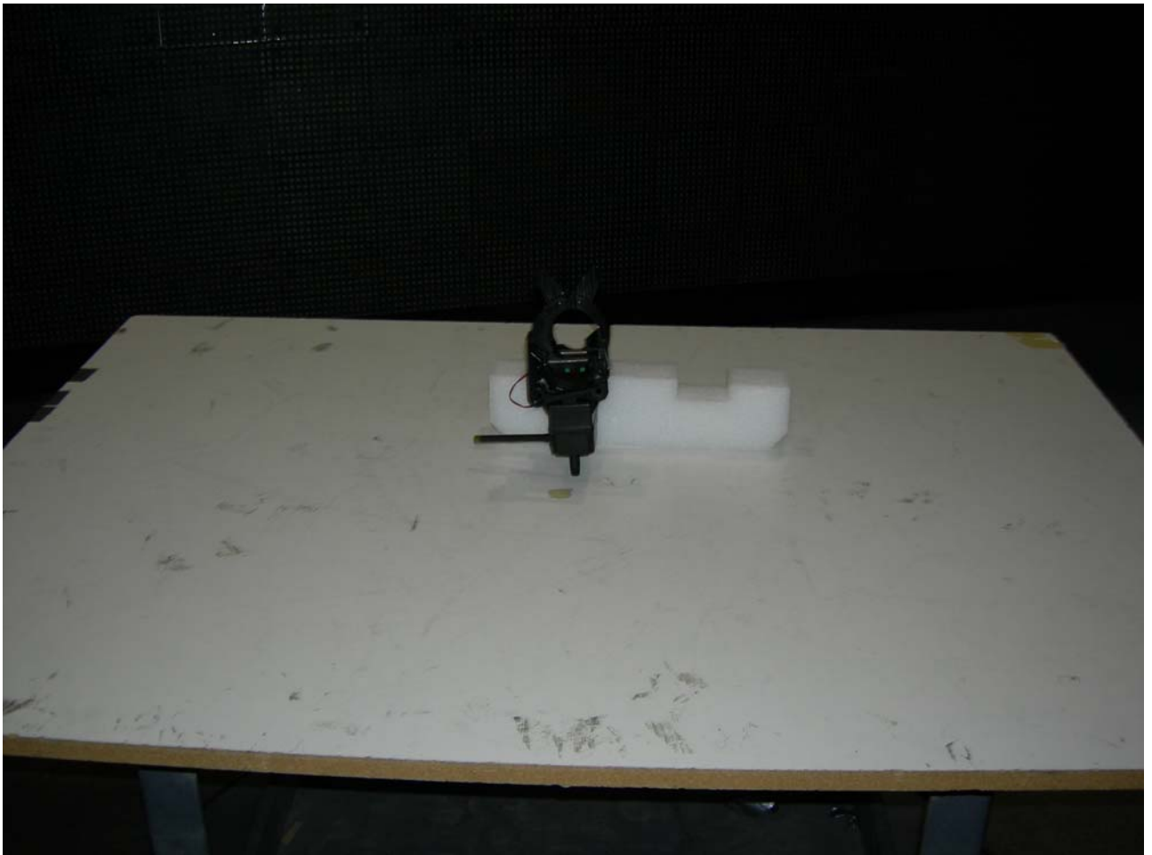
Figure 5: Unintentional Radiated Emissions.