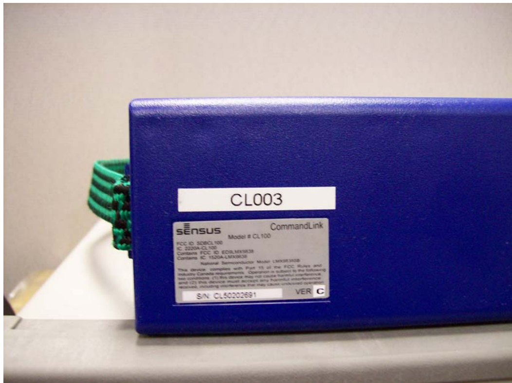
Figure 2: Label Location