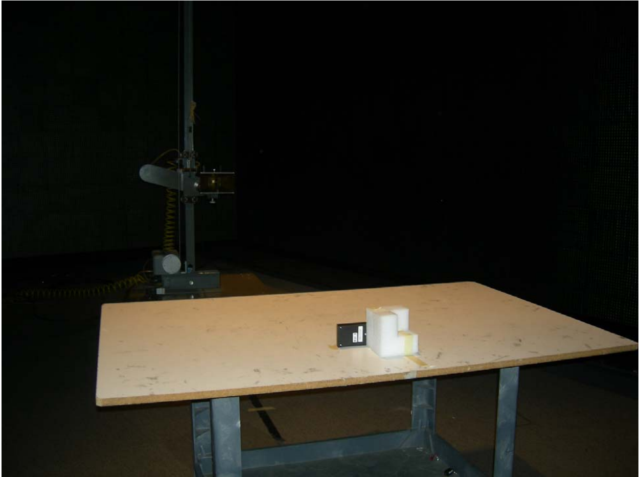
Figure 1: Radiated Emissions