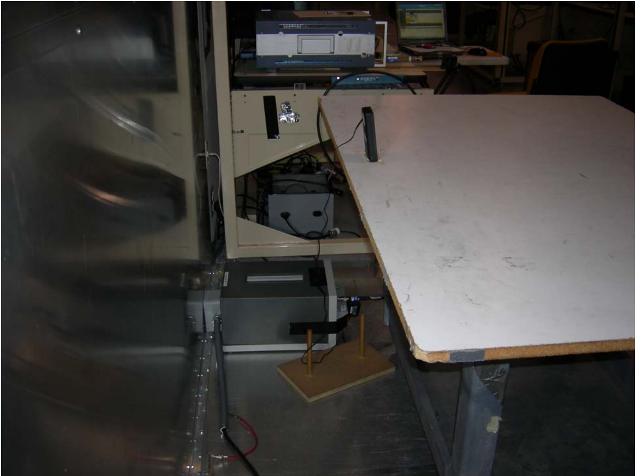
Figure 5: AC Power Line Conducted Emissions