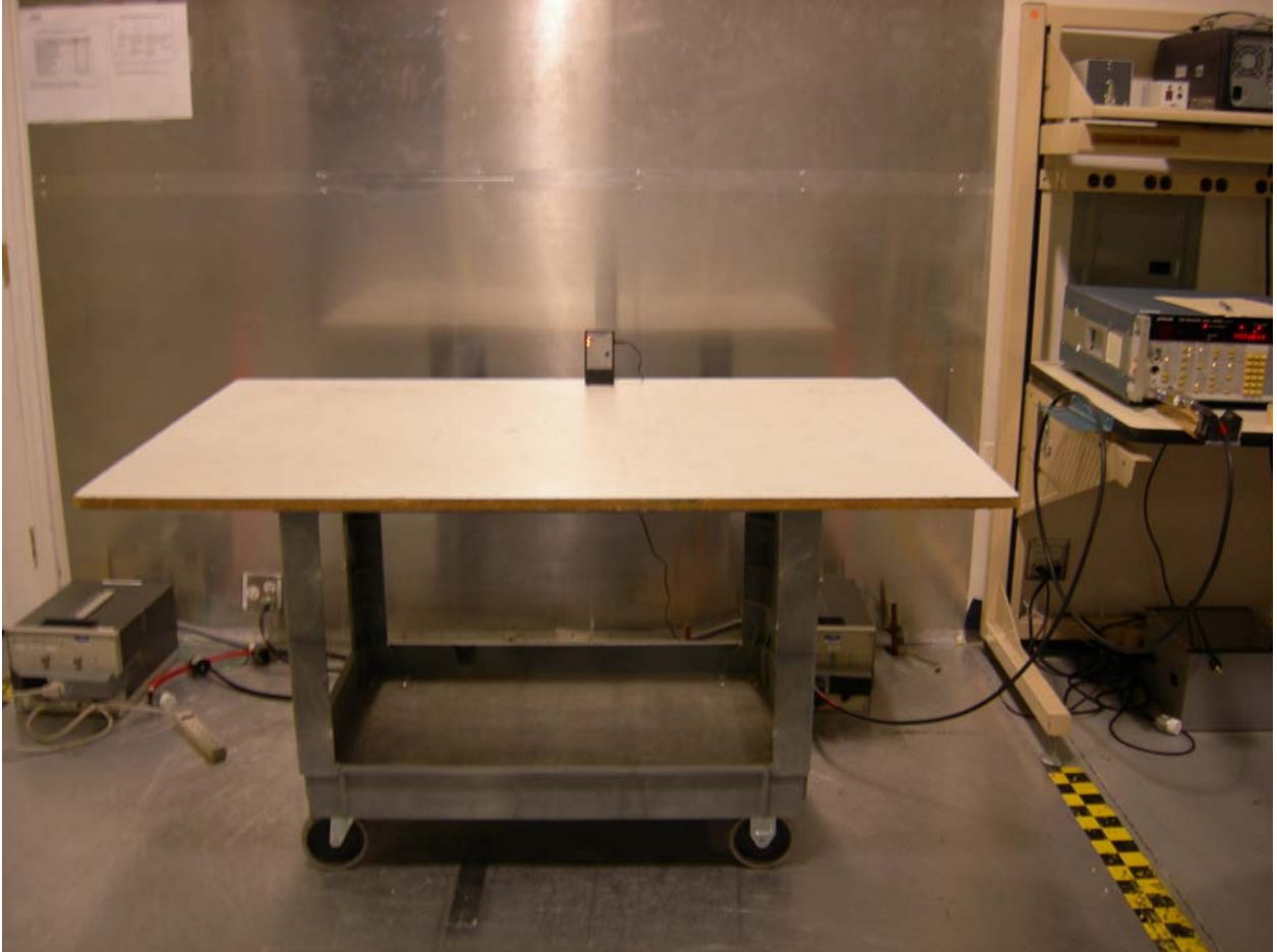
Figure 4: AC Power Line Conducted Emissions