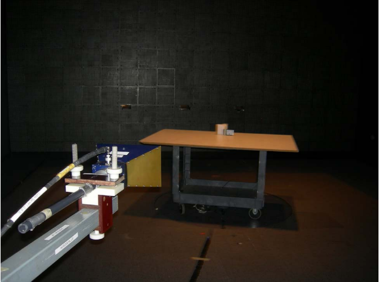
Figure 2: Radiated Emissions