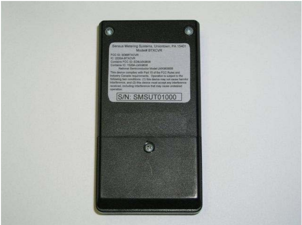
Figure 2: Label Location