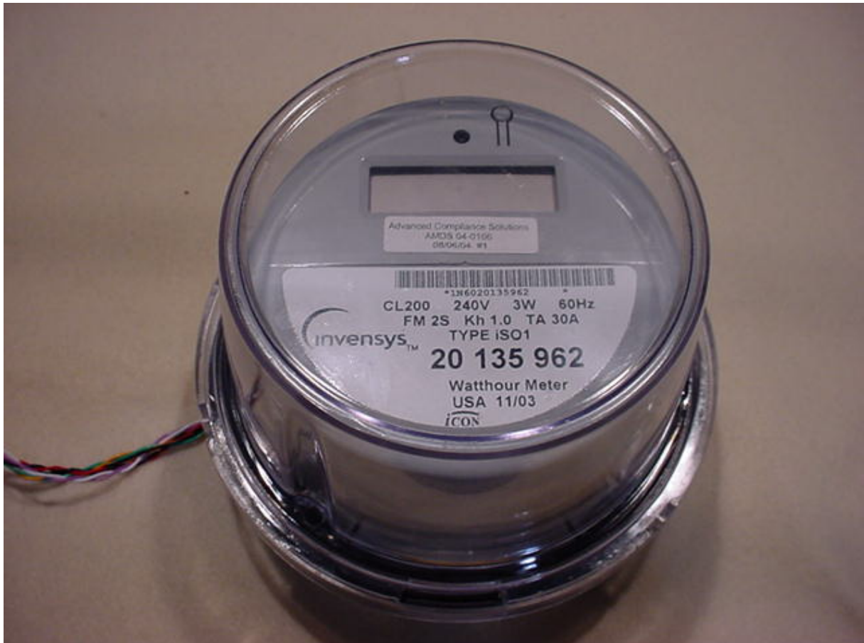
Figure 1. External - Front