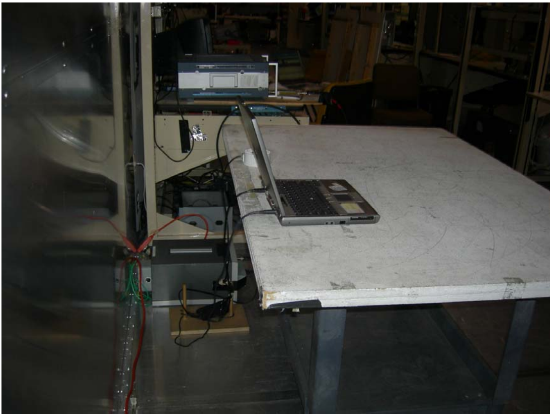
Figure 6: USB – Line Conducted Emissions