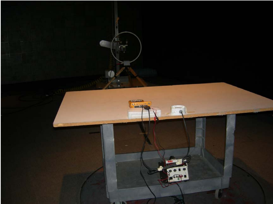
Figure 3: RS232 Serial - Radiated Emissions