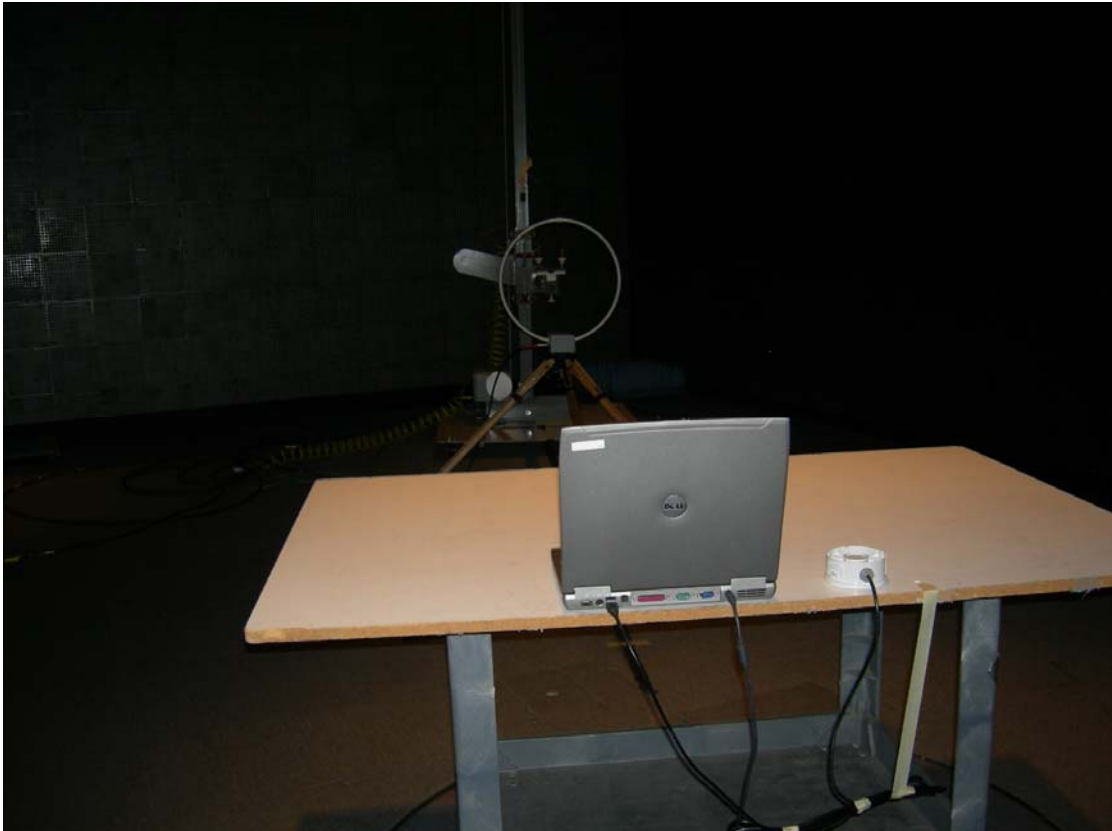
Figure 1: USB - Radiated Emissions