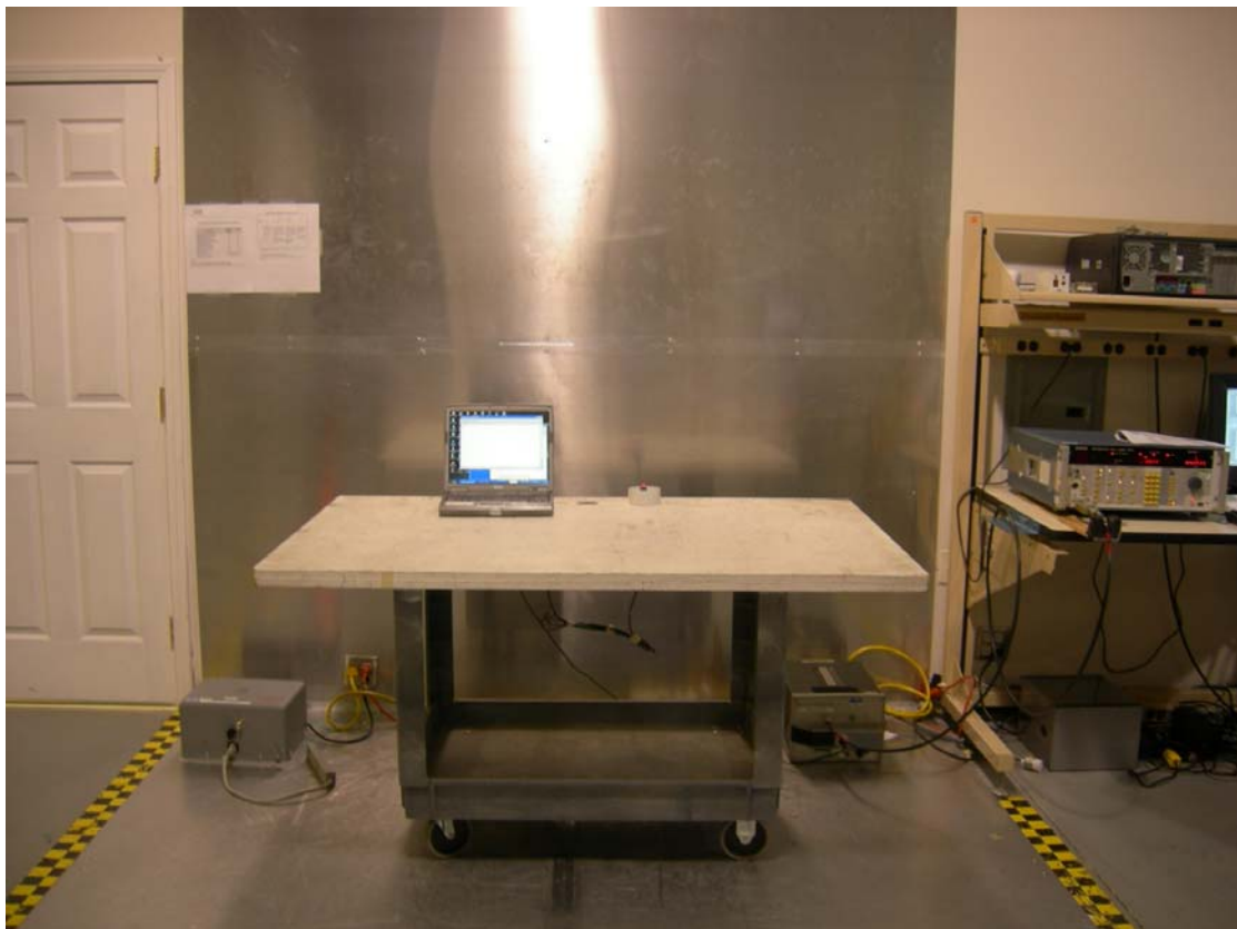
Figure 5: USB – Line Conducted Emissions