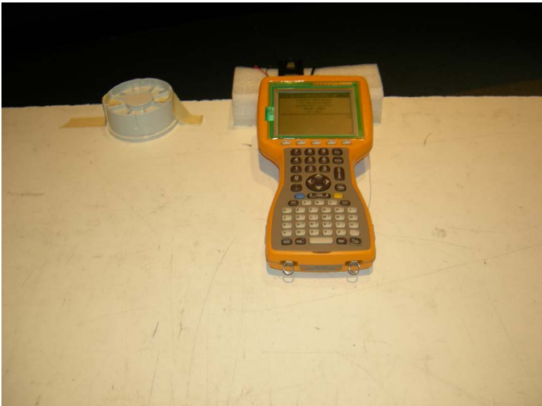
Figure 4: RS232 Serial - Radiated Emissions