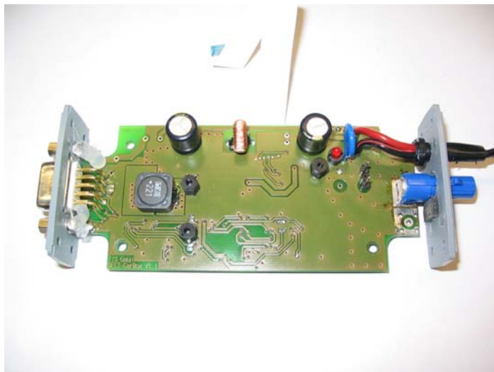
Top of PCB 1