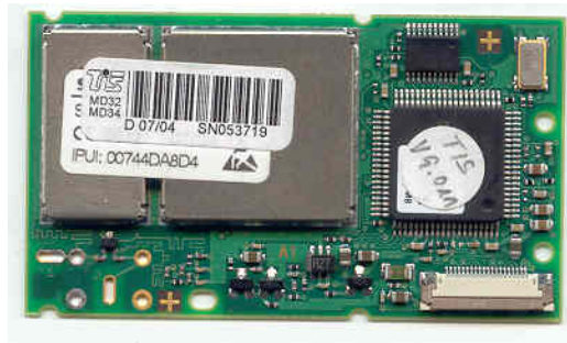
Top of RF PCB