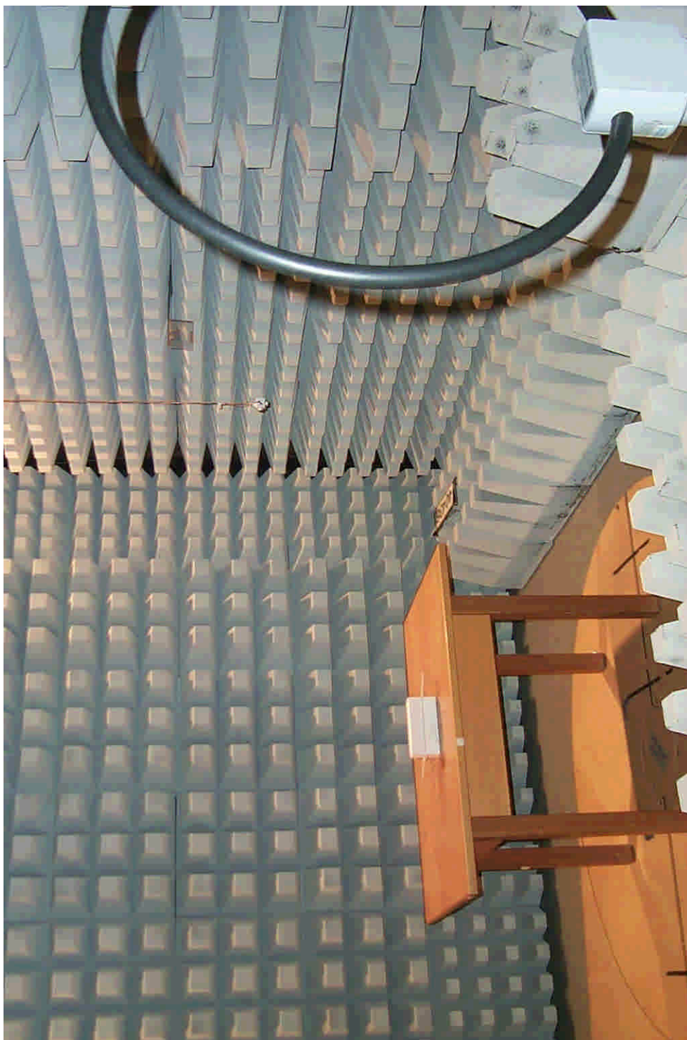
40694emi5.jpg: Test set-up preliminary radiated emission measurement 9 kHz to 30 MHz