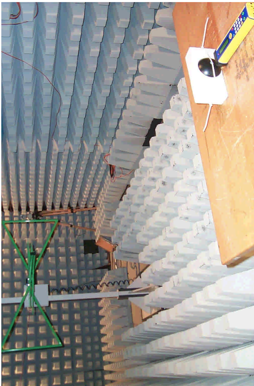
40694emi7.jpg: Test set-up preliminary radiated emission measurement 30 MHz to 1 GHz