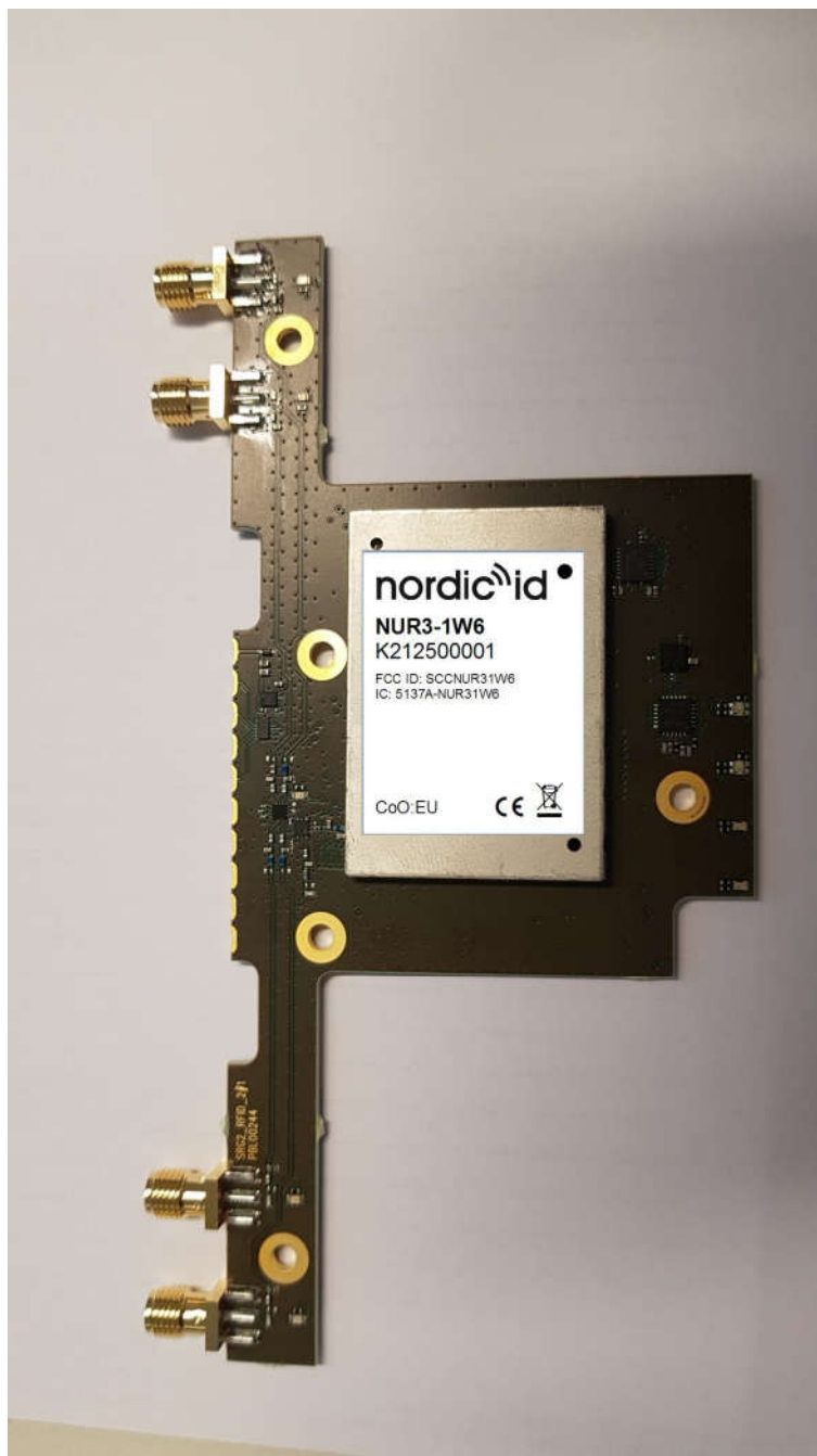
Picture 2. NUR3-1W6 top side with label