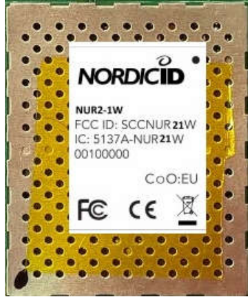
Picture 1. NUR2-1W with type label