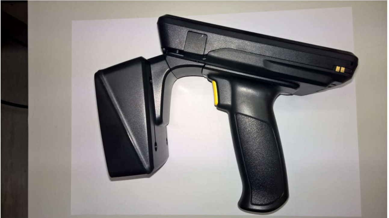
Pic. 8: EXA51 Left side view.