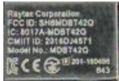
Pic.2: EXA51 CPU board top view. BLE module type lab label size increased in separate pic.