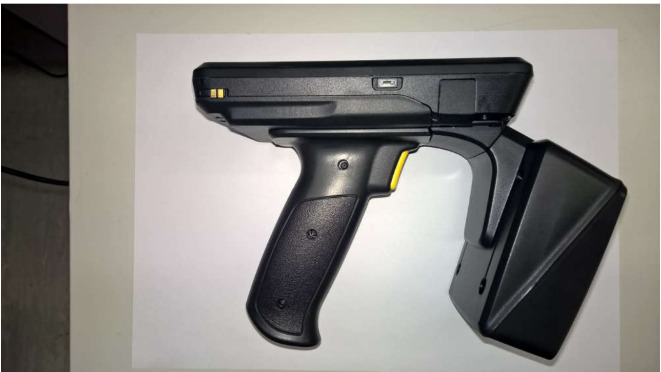
Pic. 7: EXA51 Right side view.