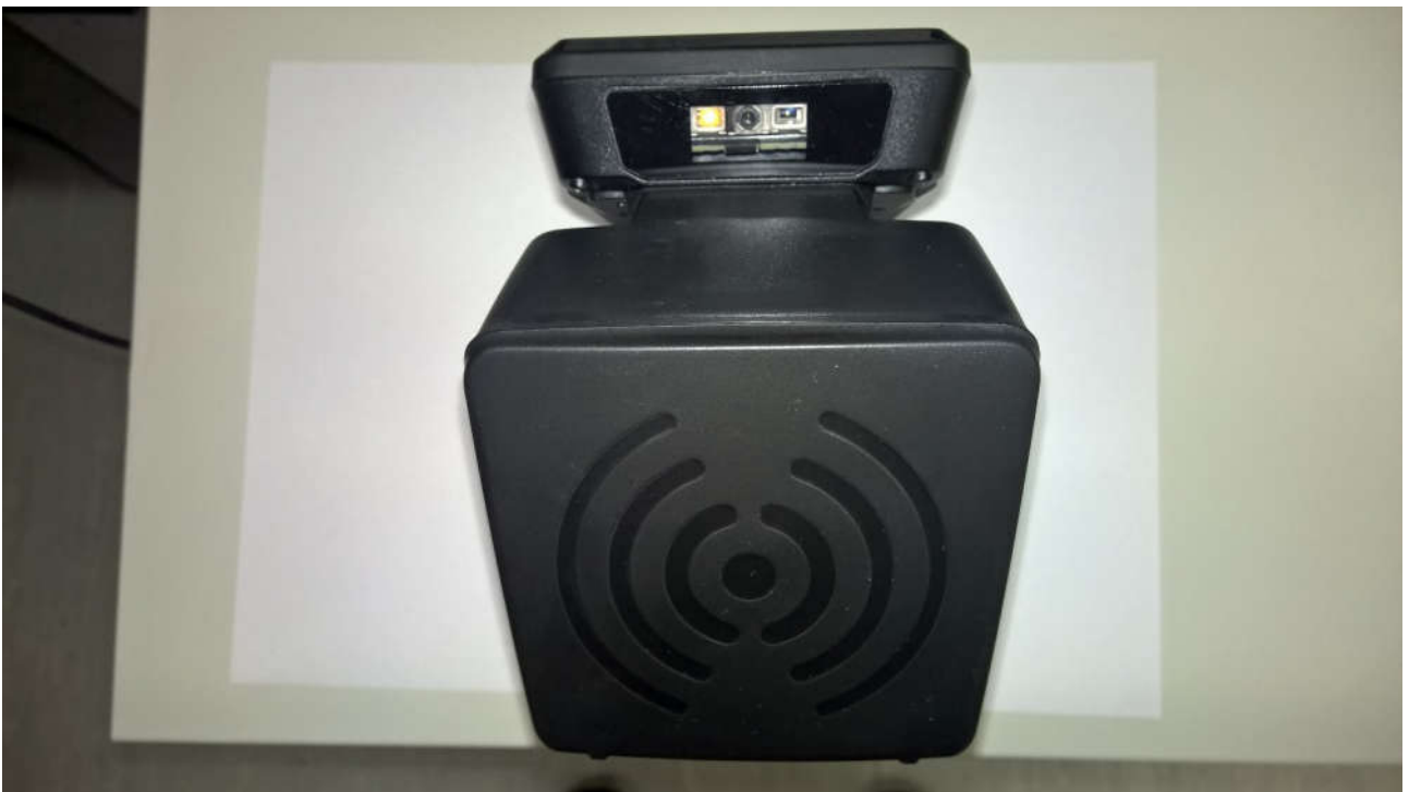
Pic. 9: EXA51 front side view.