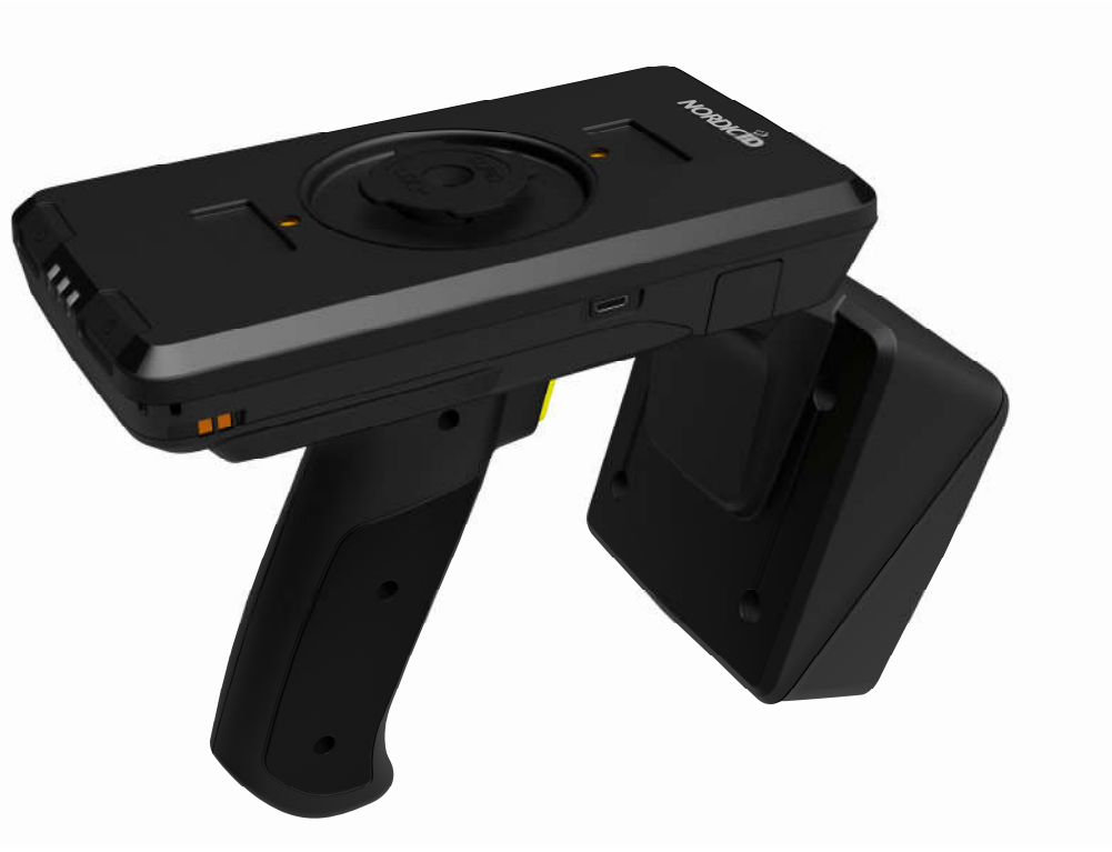
Pic. 6: EXA51 general view.