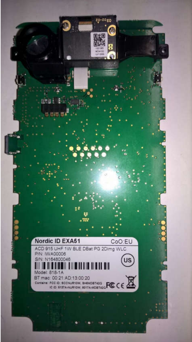
Pic.1:EXA51 CPU board bottom view.