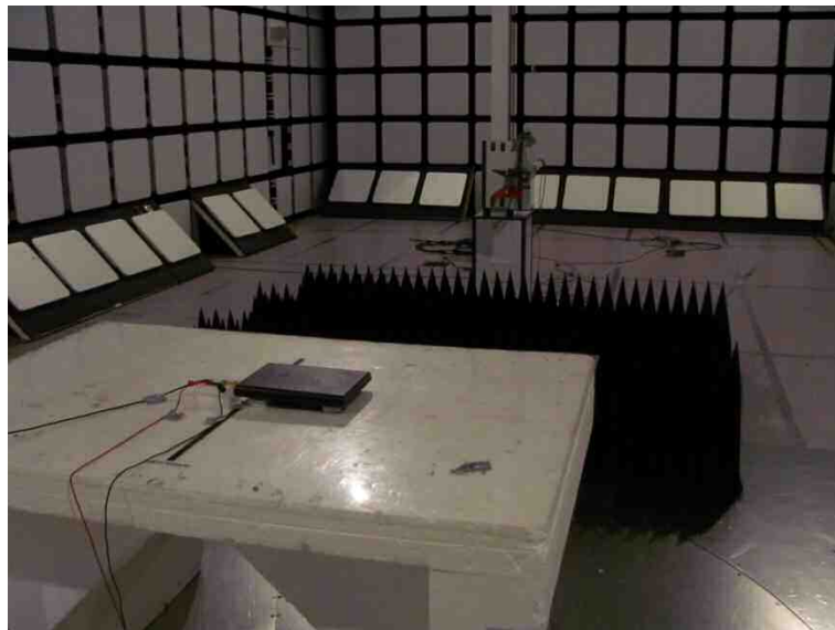
Photograph 2. Radiated emissions 1-18 GHz