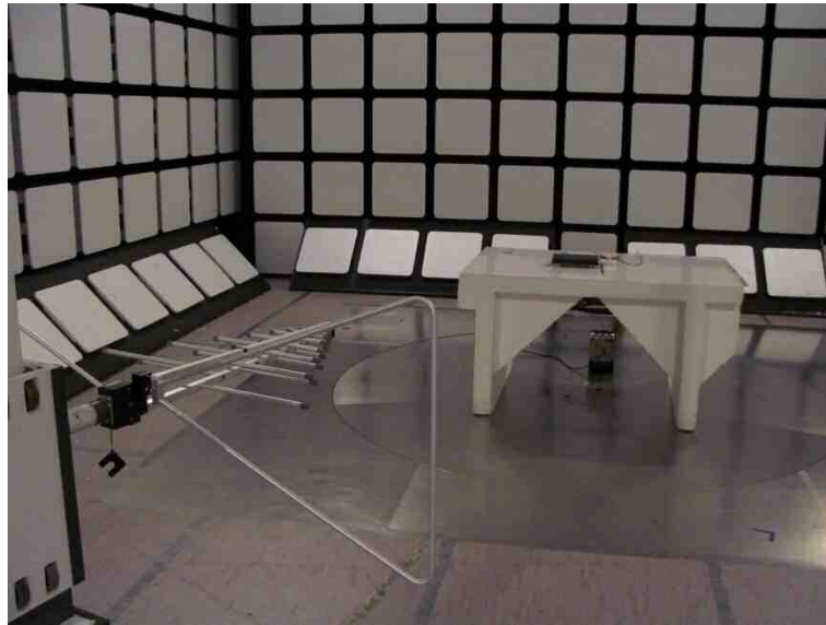
Photograph 1. Radiated emissions 30 - 1000 MHz