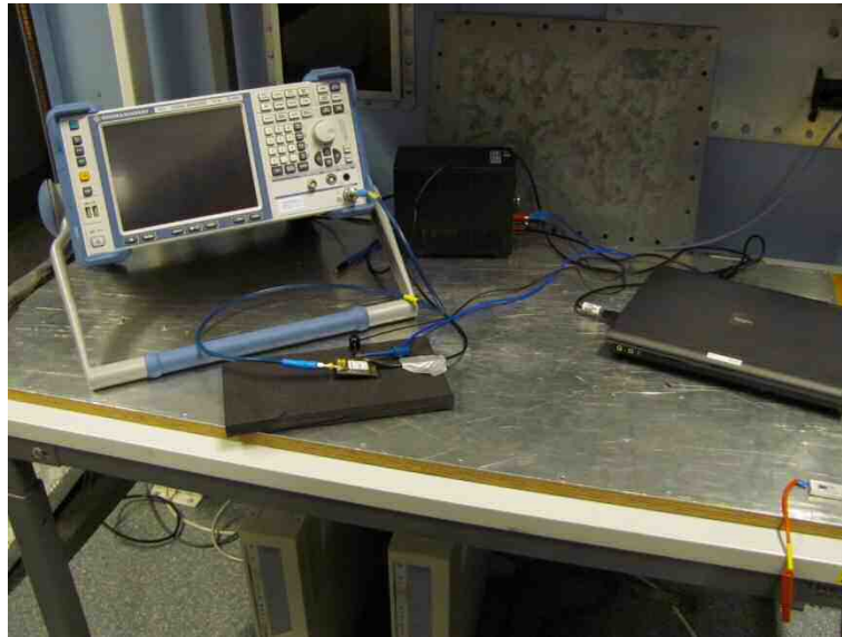
Photograph 3. Conducted RF measurements from the antenna port