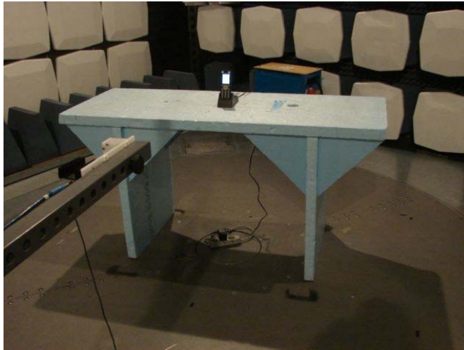
Picture 7: Transmitter Radiated emission test setup 18 GHz – 26 GHz.