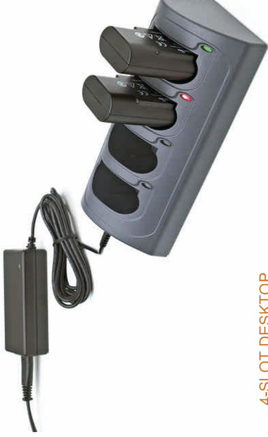
4-SLOT DESKTOP CHARGER