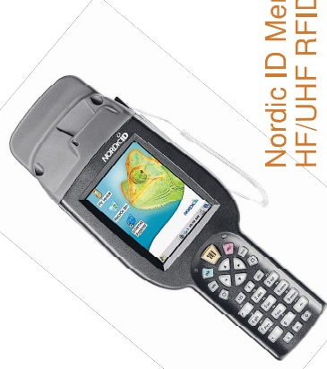
Nordic ID Merlin HF/UHF RFID