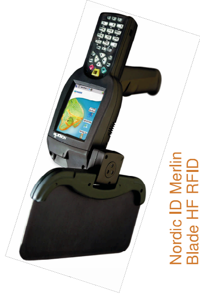
Nordic ID Merlin Blade HF RFID