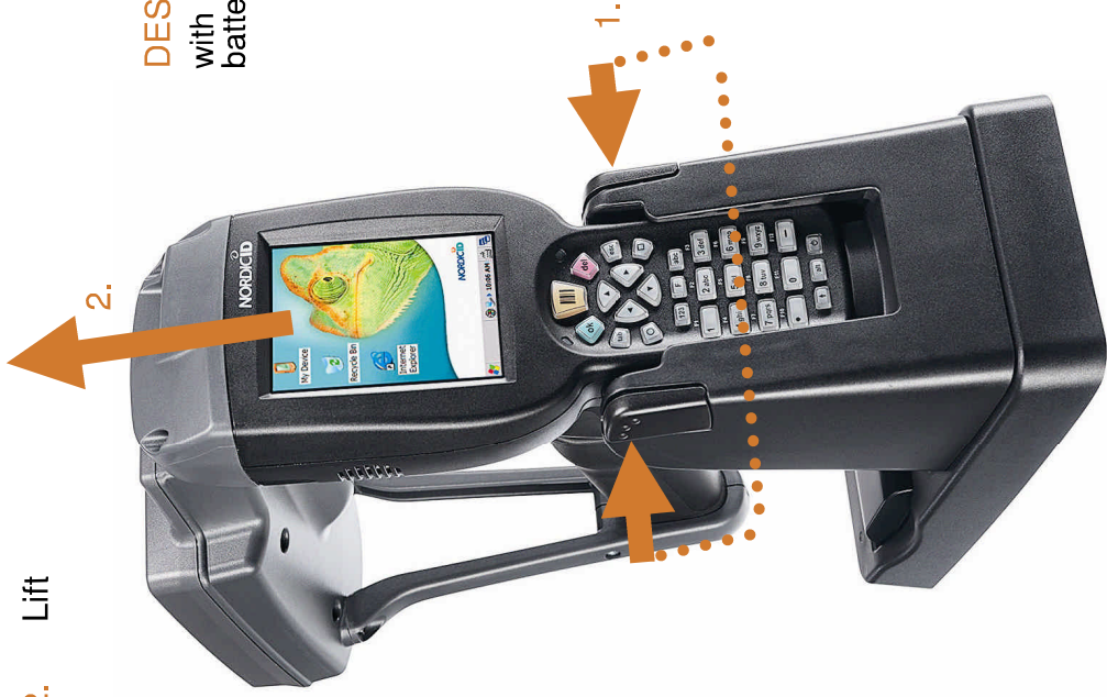
DESKTOP CHARGER with Ethernet and battery charging slot