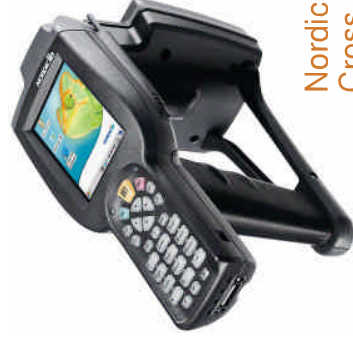
Nordic ID Merlin Cross Dipole UHF RFID