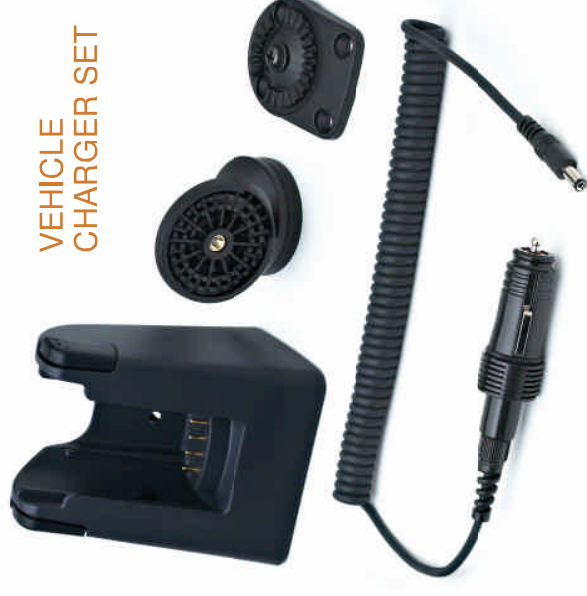
VEHICLE CHARGER SET