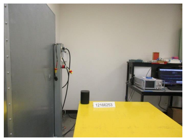
AC LINE CONDUCTED (BACK)