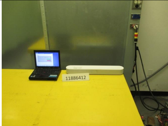
AC LINE CONDUCTED FRONT PHOTO