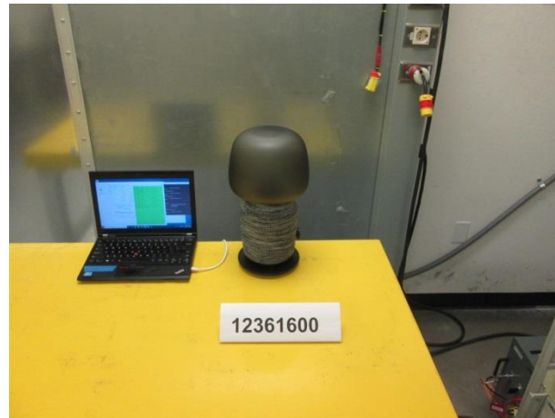
LINE CONDUCTED FRONT PHOTO