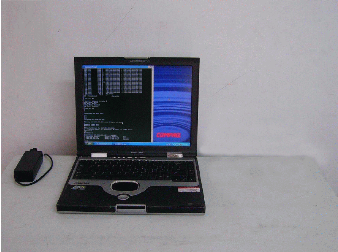
VIEW OF RADIATED MEASUREMENT