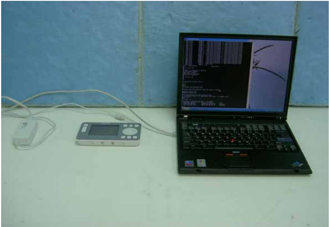
VIEW OF RADIATED MEASUREMENT