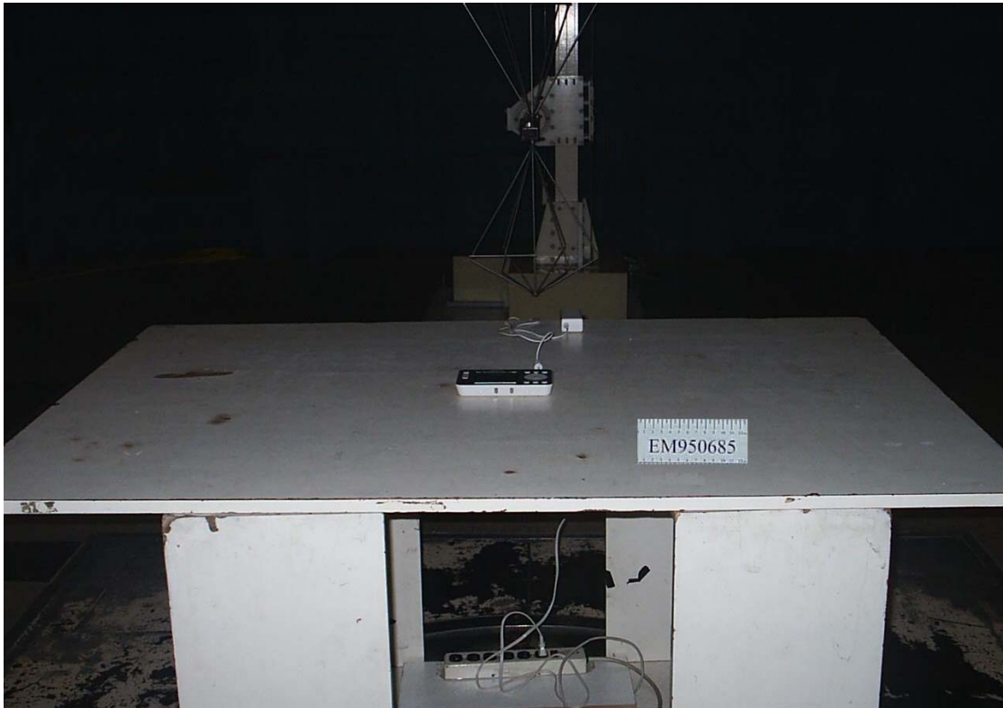
FRONT VIEW OF RADIATED MEASUREMENT