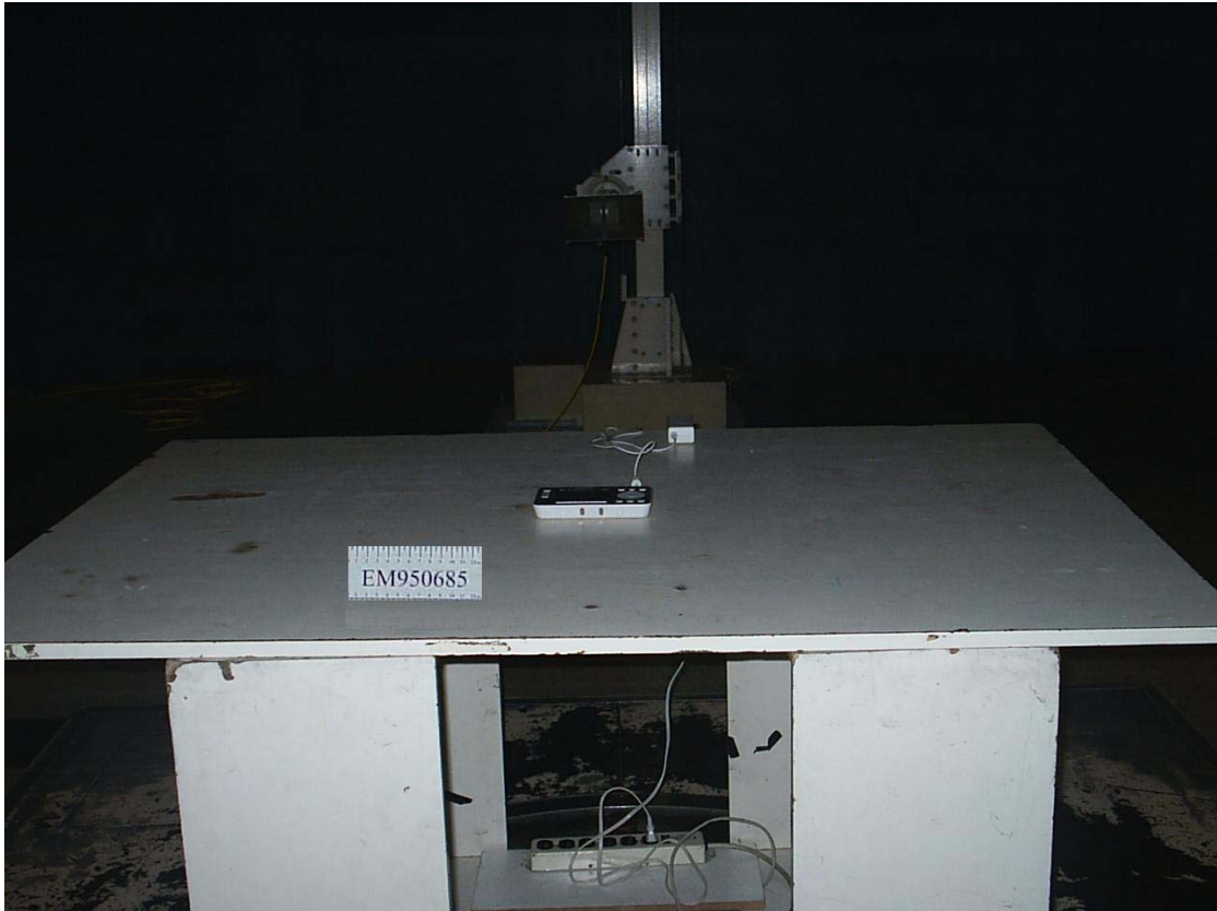
FRONT VIEW OF RADIATED MEASUREMENT