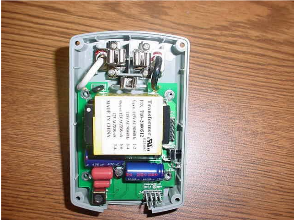
Mother Board and Connector with Transmitter board removed.