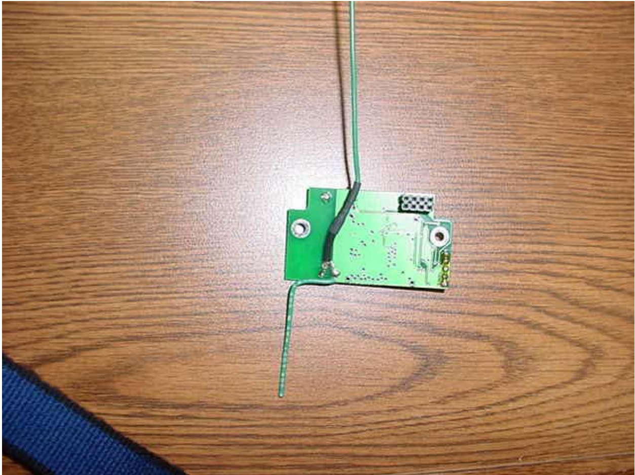
Transmitter Board – Solder View