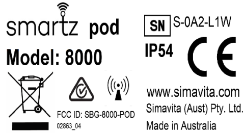
Diagram 2: Picture of a pod label