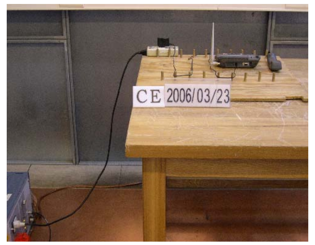
Pic1 Conducted Emission