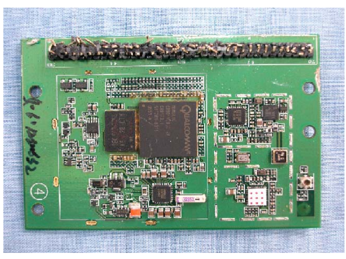
Fixed Wireless Phone front view