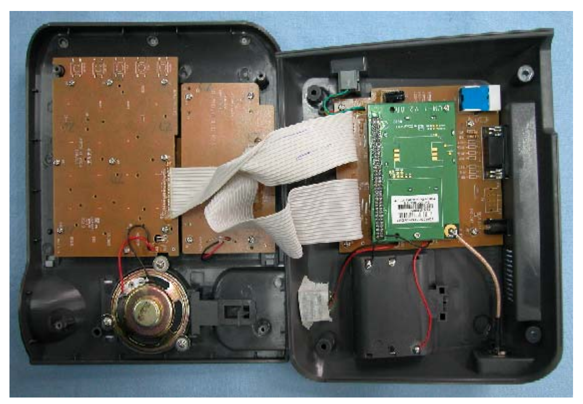
Fixed Wireless Phone Disassembly