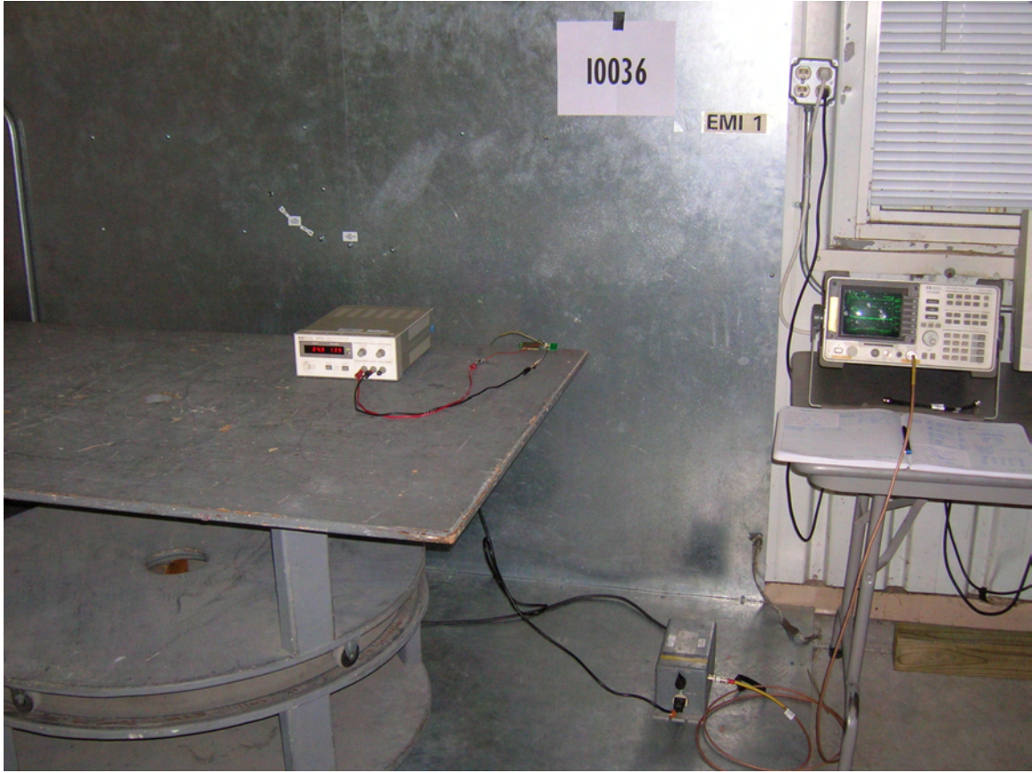
Line Conducted Emissions